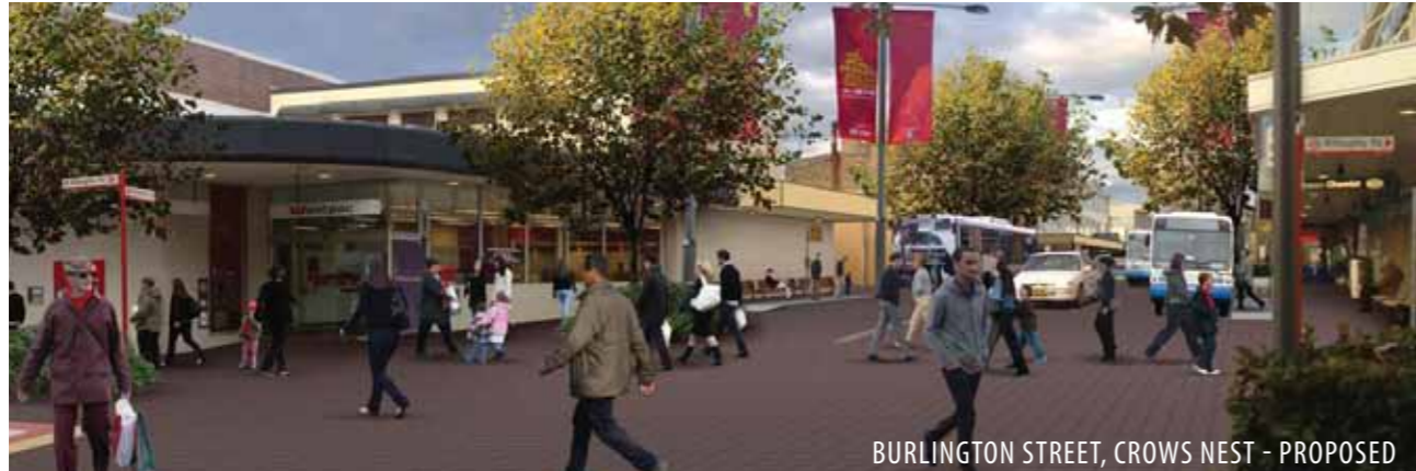
BURLINGTON STREET, CROWS NEST - PROPOSED