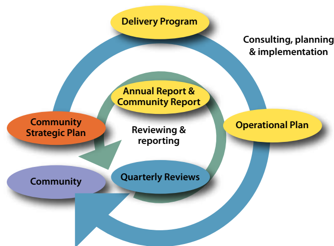
The Planning and Reporting Cycle

Set out opposite is a diagram which shows where the Community Report fits into Council's integrated corporate planning framework.