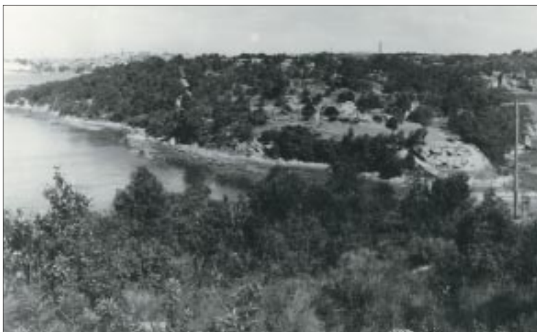
Berry Island Reserve, 1937

In the early 19th century, this small island was attached to the property of Edward Wollstonecraft on the mainland by a stone causeway over mud flats. After he died, the property was passed to his sister and her husband, Alexander Berry. There was great debate over the use of the area for commercial and/or residential purposes. Public protests saw that the island was dedicated as a nature reserve for public recreation in 1926, along with Balls Head Reserve. In the 1960s the mudflats were filled in with car bodies, building rubble and relocated soil to create a grassed area.