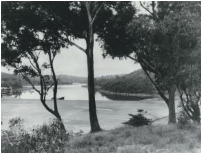
Primrose Park and Willoughby Bay, 1937

The Willoughby Falls area in the western gully was a favourite picnic spot in the early days of white settlement. This park was named after H L Primrose, a North Sydney Mayor from 1926 to 1932 and later NSW Minister for Health. The oval was once an estuarine bay and in 1899, was the site of North Sydney's first sewage treatment works that serviced North Sydney and parts of Willoughby and Mosman. The former engine house and compressor houses, tunnels and canals can still be seen today and the remaining buildings are the home of the Primrose Park Art and Craft Centre as well as a range of sporting clubs. The sewage works closed in the late 1920s and the area was dedicated as parkland in 1930.