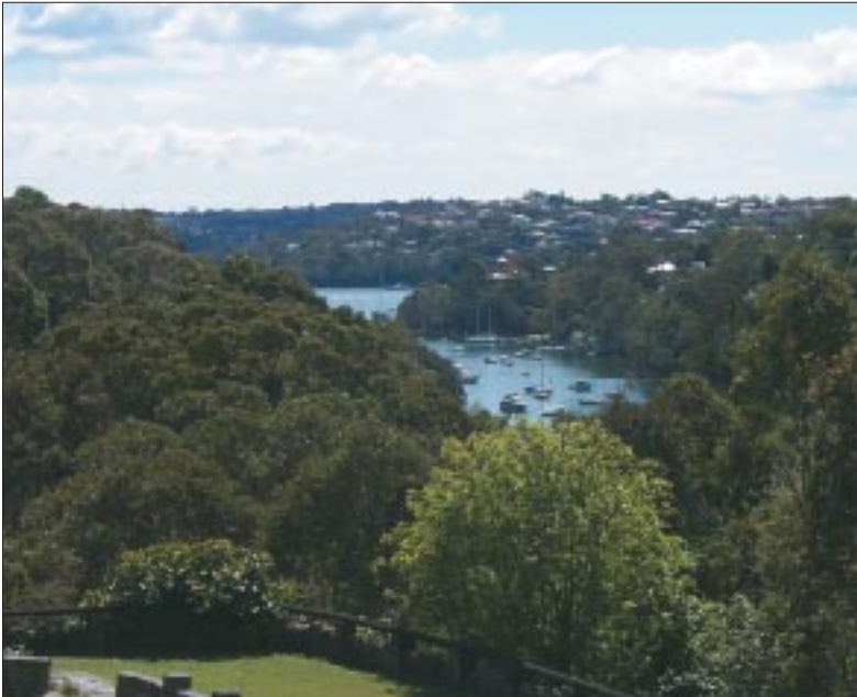
View of Primrose Park and Willoughby Bay from Grafton Street

Both the indigenous bush and weeded areas provide habitat for an array of wildlife. Look for Eastern Water Dragons sunning themselves on the rocks surrounding the waterfall in the middle of the day. Listen for the chorus of bird species including: Whip Birds, Rosellas, Lorikeets, Butcher Birds, Noisy Miners and sea birds around the foreshore. Masked Plovers, Magpies and Crested Pigeons forage for food on the oval. In the dense understorey White-browed Scrub-wrens can be seen. Kingfishers visit and migrate to the creek line. Up in the trees, the Boobook Owl and Tawny Frogmouths roost.