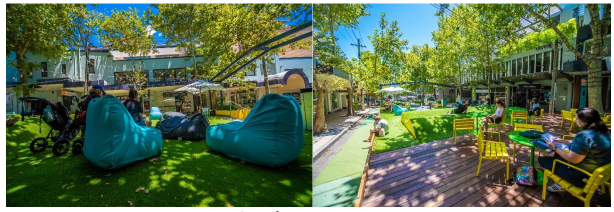
Event: Music Performance – 21 January 2021

Council's Project Manager stated that traffic hasn't been impacted as much as people initially thought. Council has traffic counts; they show at the moment the impact hasn't been chaotic. Council has a consultant doing a complete traffic impact assessment which will be finalised by the end of this month and then Council will have more defined findings in terms of traffic. The findings are showing that queuing times have increased but not by much.