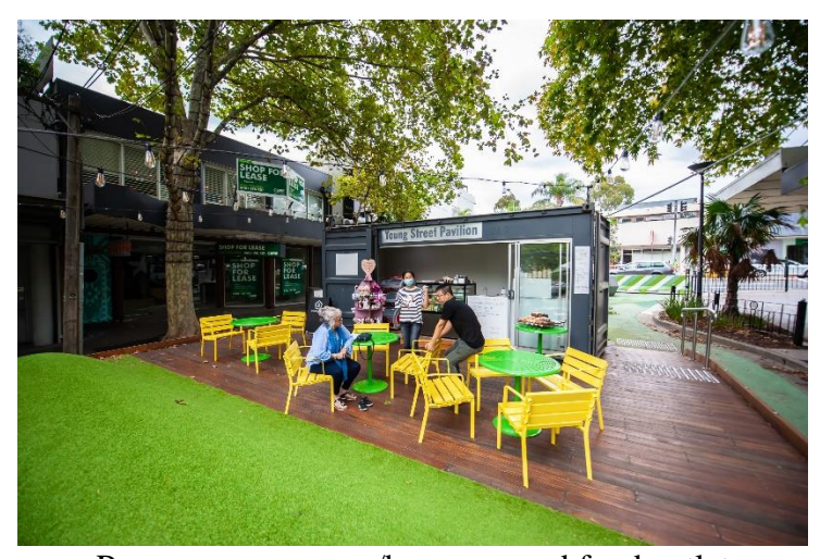
Pop-up newsagency/beverage and food outlet

Above is the Pavilion which was installed as a buffer to try to separate the noise and the look of Military Road and the Plaza. The shipping container is currently being used as a pop-up shop. It is currently being run by one of the local businesses as Council invited all the businesses in Young Street to give an expression of interest, one of businesses responded with a proposal to have a café/food outlet and the business has operating since the end of January 2021. So far Council hasn't had any issues with Graffiti in the plaza.