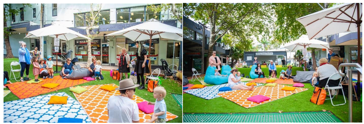
Event: StoryTime with the Stanton Library - 9 February 2021