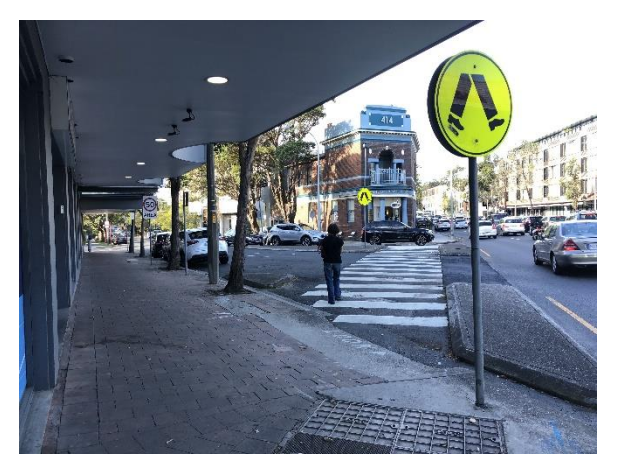
LOCATION 5 – MACPHERSON STREET AND MILITARY ROAD PEDESTRIAN CROSSING IMPROVEMENTS

All crossings on the southern side are raised. Those were the preferred options as part of the consultation.