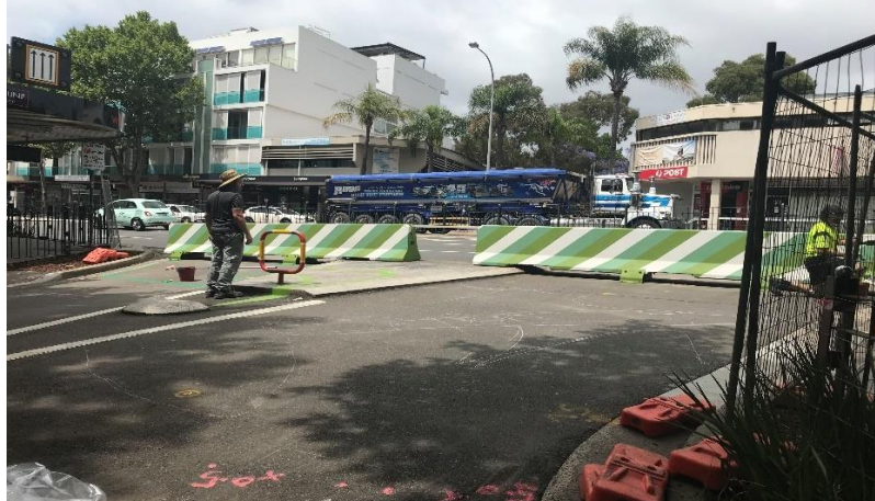
MILITARY ROAD – CONCRETE BARRIER AND ROAD GRAPHICS

The graphics are starting to be put in place on the roadway.