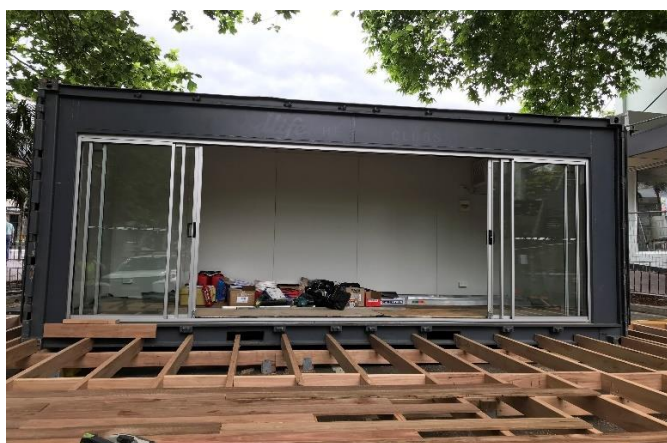
MAIN PAVILION - HIRED CONTAINER

Council had erected a multi purpose container in place, which has had some interest from café and business owners who want to utilise the container. It has other purposes as well; it can also be used for community events if not as a pop-up business. It will be dressed up and made to look nice and vibrant, and it will match the graphics of the plaza once it has been finished.