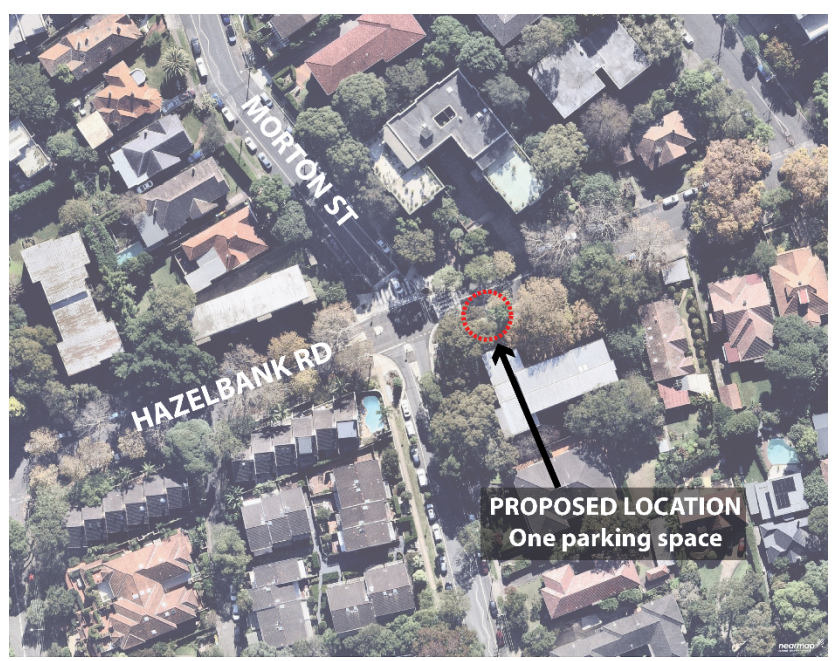
Map 4. Proposed dedicated car share location Hazelbank Road, Wollstonecraft

Car Share schemes provide several potential benefits to scheme members and the broader community as they can: