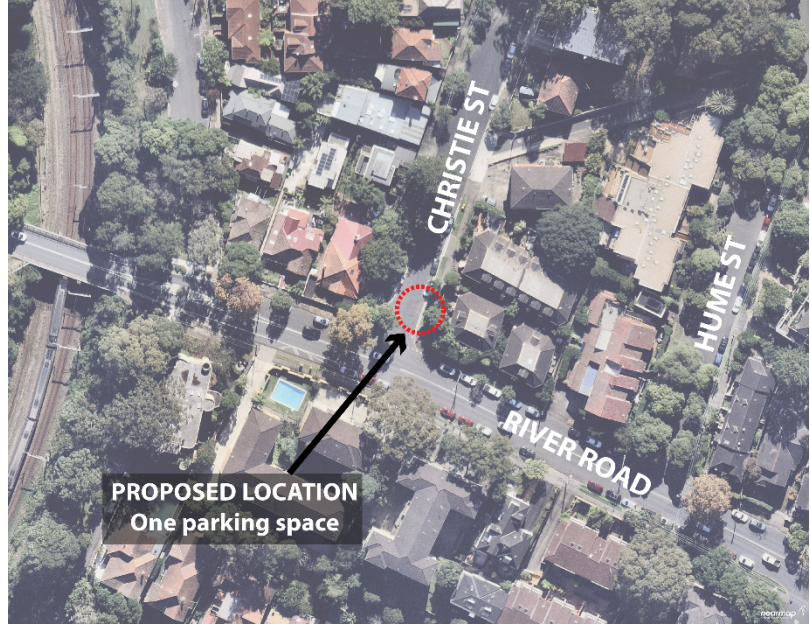
Map 3. Proposed dedicated car share location Christie Street, Wollstonecraft

Map 2. Proposed dedicated car share location Gillies Avenue, Cremorne Point