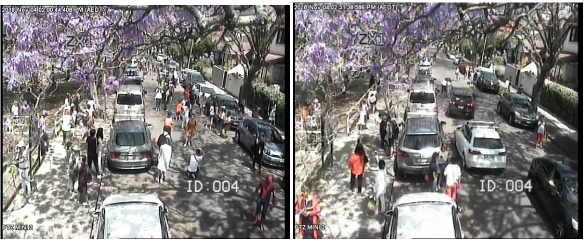
Figure 2 typical observations from CCTV footage during jacaranda blooming (November 2018)