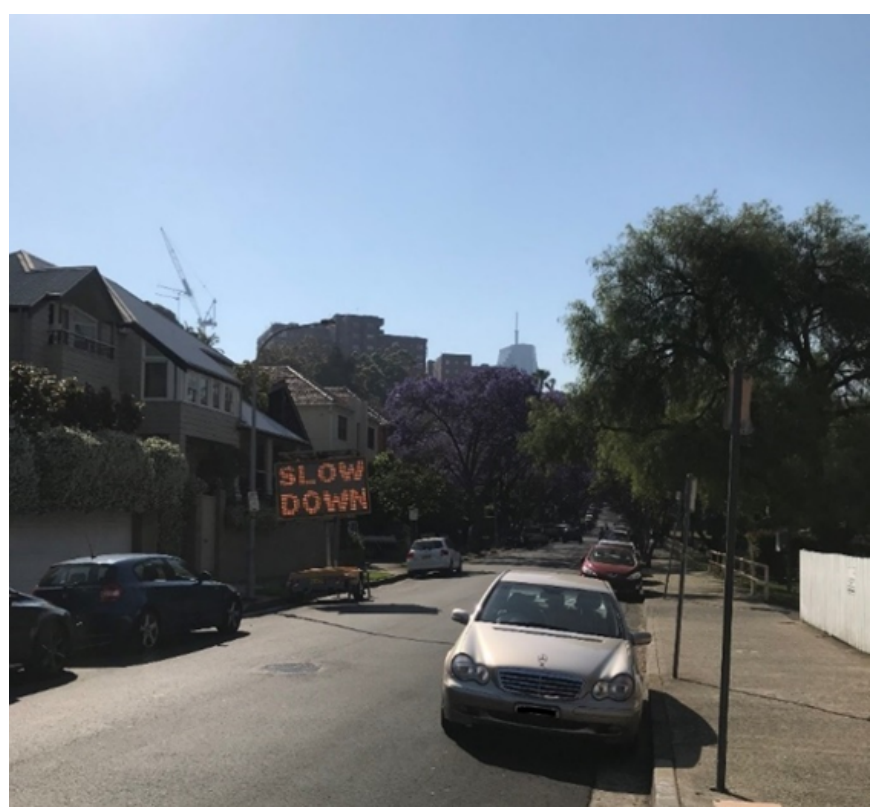
Photo 3. VMS Signs installed in McDougall Street during the 2019 Season