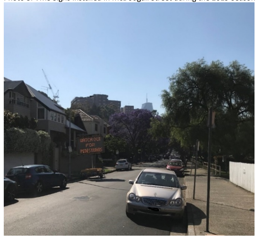
Photo 4. VMS Signs installed in McDougall Street during the 2019 Season