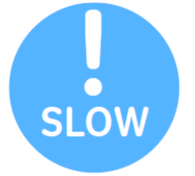
Figure 3 example '! SLOW' path marking

As an immediate action to reduce the potential for conflict on the path, it is recommended that "blue line" '! SLOW' and 10 kph speed advisory shared path marking be installed.