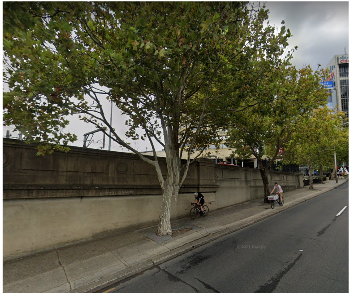
Figure 2 Image of the path taken from Google Maps showing riders choosing different routes around trees

Observations were conducted at the site following the issue being raised at Traffic Committee. During the site observations, no incidents of conflict or 'close calls' were observed. However, it was noted that the path is constrained by a concrete wall on one side, and that trees and posts interrupt the path. Where trees and poles are present, the path widths do not satisfy minimum width requirements for a shared path. Both pedestrian and riders were observed diverting different ways around trees and poles, which likely increases the potential for conflict between the two groups.