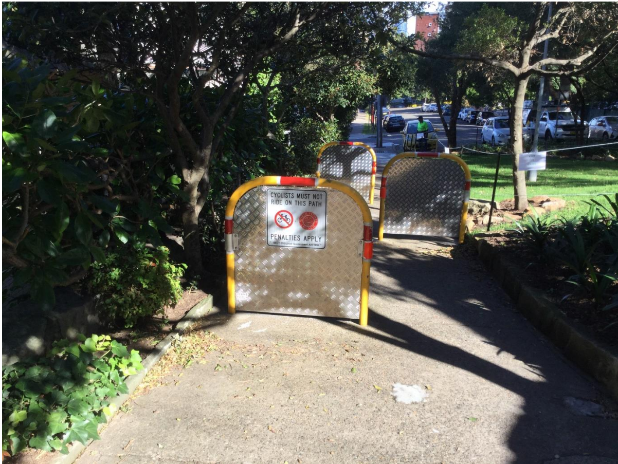
Figure 1. Dismount signage on existing chicanes