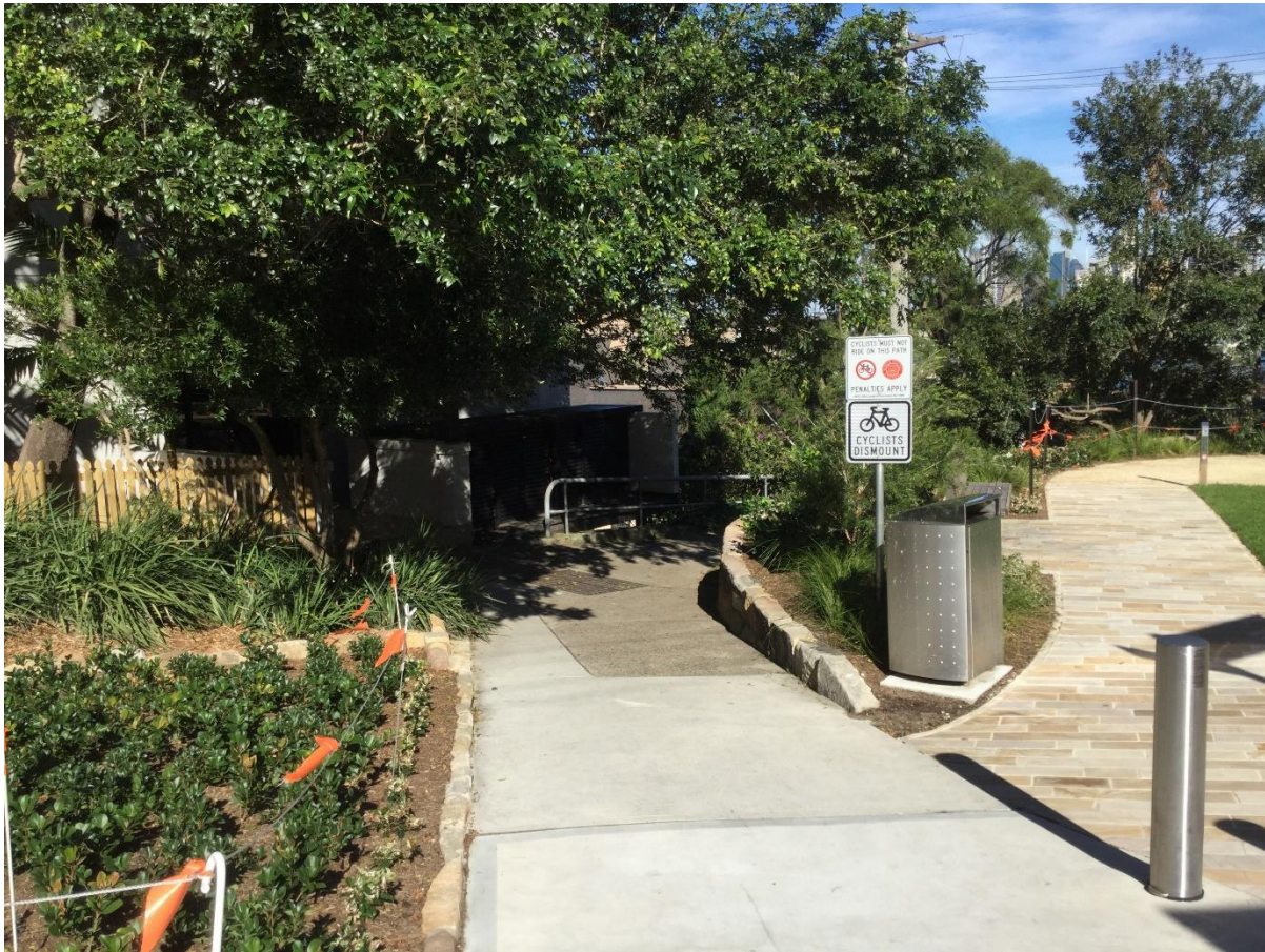
Figure 3 Dismount Signage at Blues Point Road

Following the works, Council received six (6) community submissions seeking that the path be reopened for people cycling, most of which also put forward a view that closing the path represented a risk as there is no suitable, low traffic alternative for people riding. Council also received two (2) written submissions and verbal feedback that people were continuing to ride on the path despite the signage.