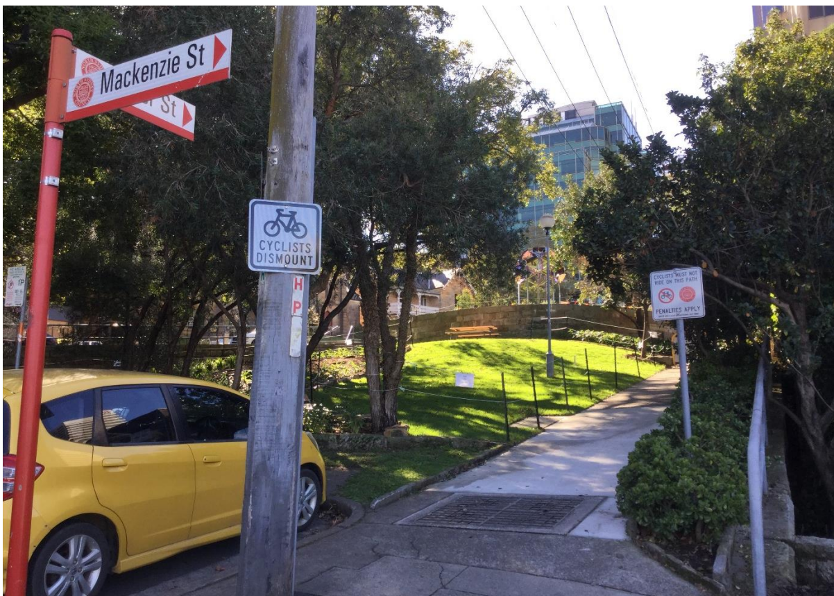
Figure 2 Dismount signage at Mackenzie Street