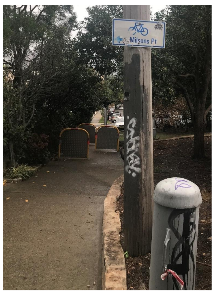
Figure 3 Existing chicanes in St Peters Park