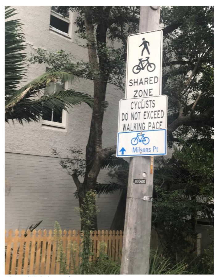
Figure 5 Existing path signage

Feedback from the community also included a request that existing signage permitting use of the path by people cycling was removed. This signage is shown in Figure 5.