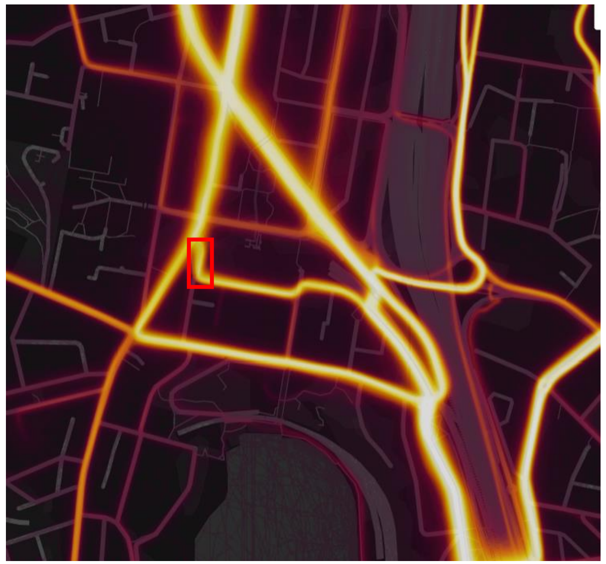
Figure 5. Extract from Strava Heatmap showing the site and relative number of bike trips.

Given that the removal of signage may have a range of slow on impact, an assessment of potential responses to this matter and considerations are presented in Table 1 to assist Traffic Committee members and Council in determining a preferred outcome.