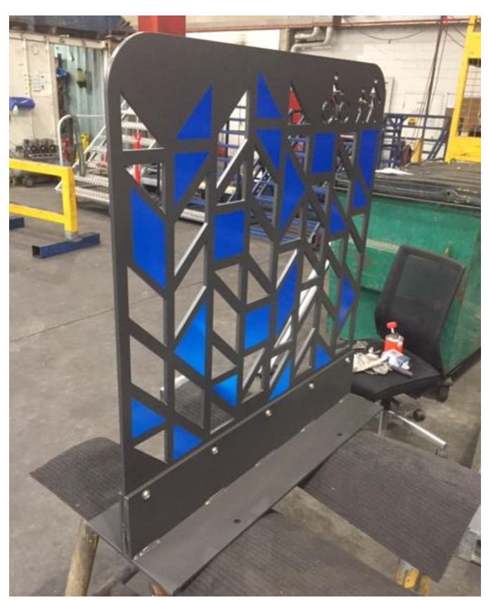
Figure 4 Site-specific chicanes for St Peters Park