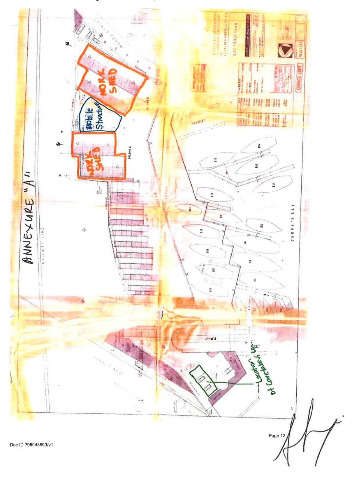
Annexure A - Plan showing Caretakers Unit, Mobile Structure and Worksheds