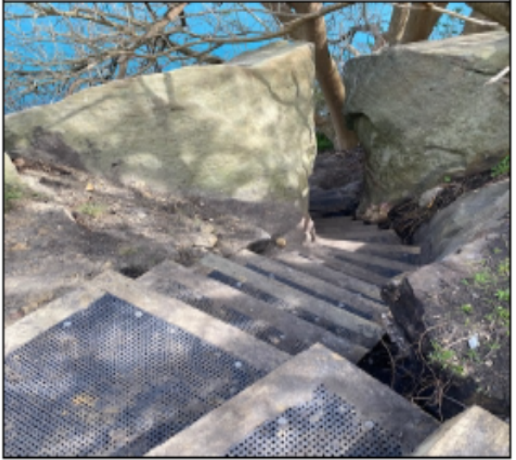
Primrose Park New Foreshore Access