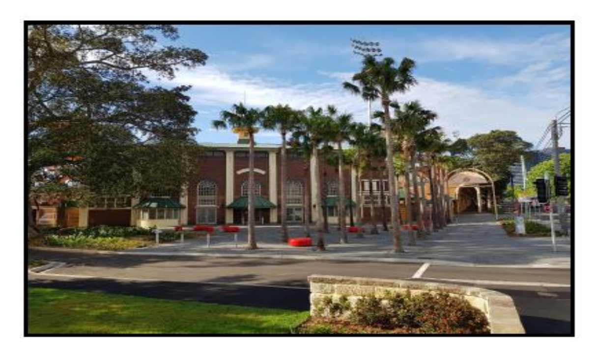
Stage 2b1 – Cricket Practice Net Upgrade

These works have now been completed and the area is now open and transformed to an open free-flowing landscape where all elements merge together to provide a grand entrance to St Leonards Park.