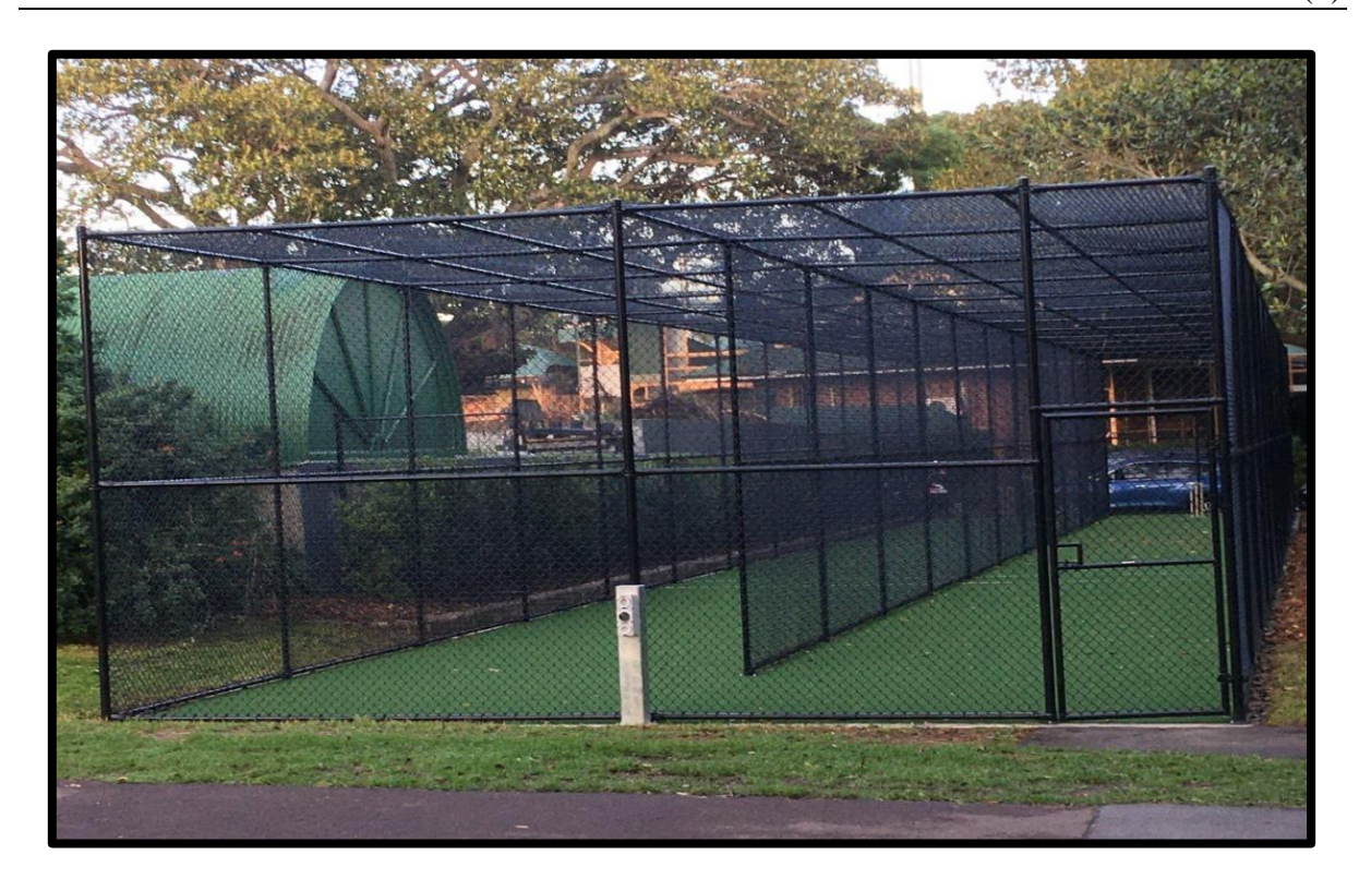
Stage 2b2 – Tunks Way (north of Cenotaph)

The tender for improvement works on this section as identified in the Masterplan has been awarded to Co-Ordinated Landscapes who will be commencing work in January 2021.