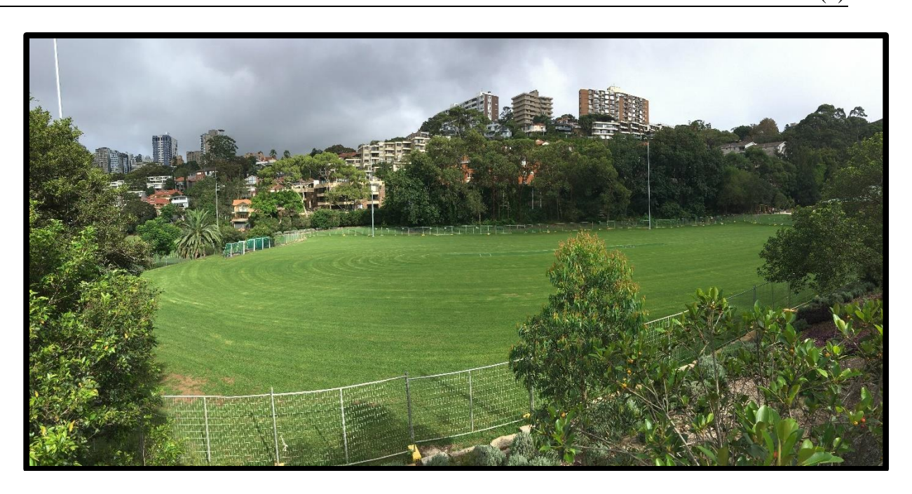
Council staff have scheduled sand grooving to be undertaken in December 2020 to aid in drainage of the site.