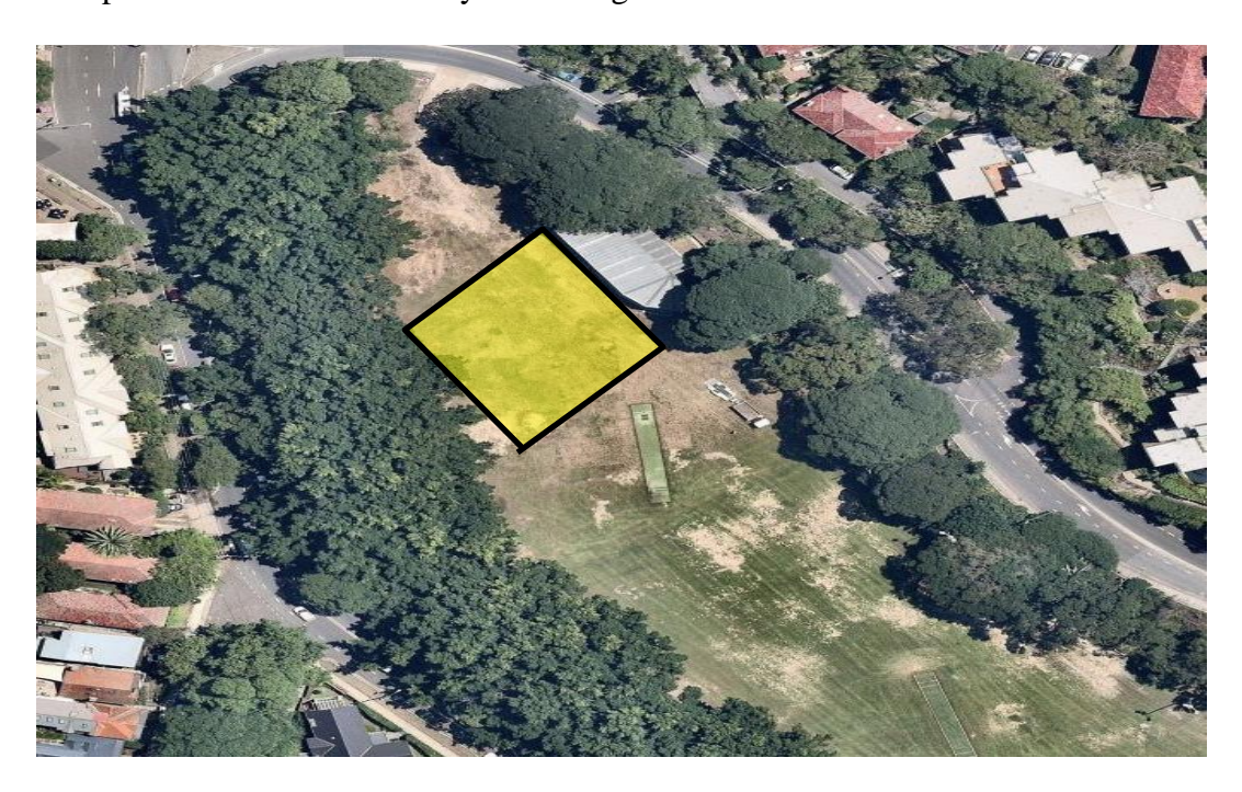
Forsyth Park - A netball hoop (or 2) could be installed in the turf area indicated below

Anderson Park – Potentially a netball or basketball hoop could be installed in the turf area indicated below. However, this area of the park is not irrigated, and this type of use would make it impossible to retain a healthy cover of grass.