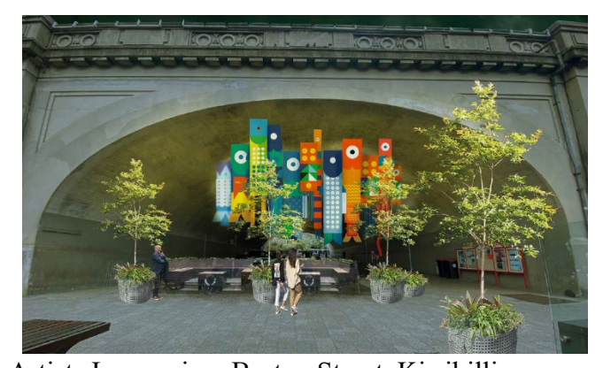
Artists Impression, Burton Street, Kirribilli