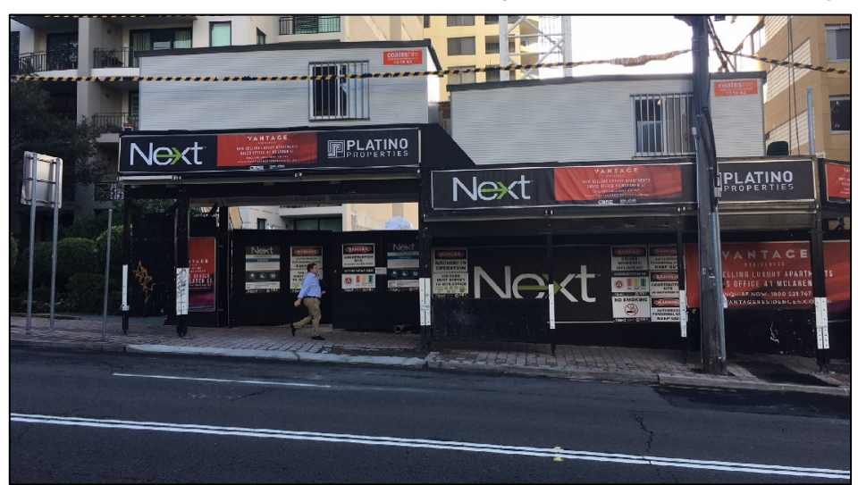
Figure 2: B Class Hoarding with Site Sheds