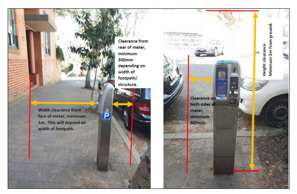
Figure 5: Parking Meter - clearance details, for hoarding or other structures

All parking meter bay numbers and line markings must remain clearly legible at all times. Where bay numbers are on the top of kerb or footpath and are obscured by the hoarding, the numbers must be clearly (min 100mm) and identifiably painted or printed/laminated and fixed on the hoarding adjacent to the relevant parking bay at a height of approximately 1.5m.