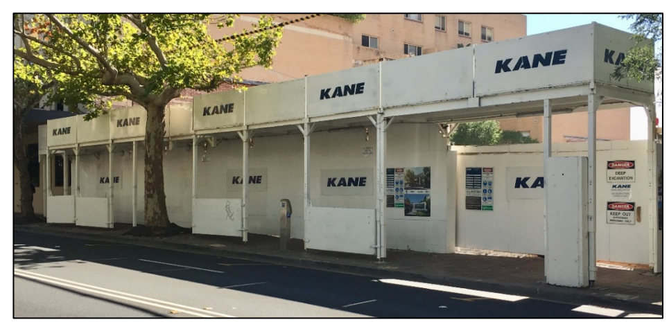
Figure 1: Stand Alone B Class Hoarding