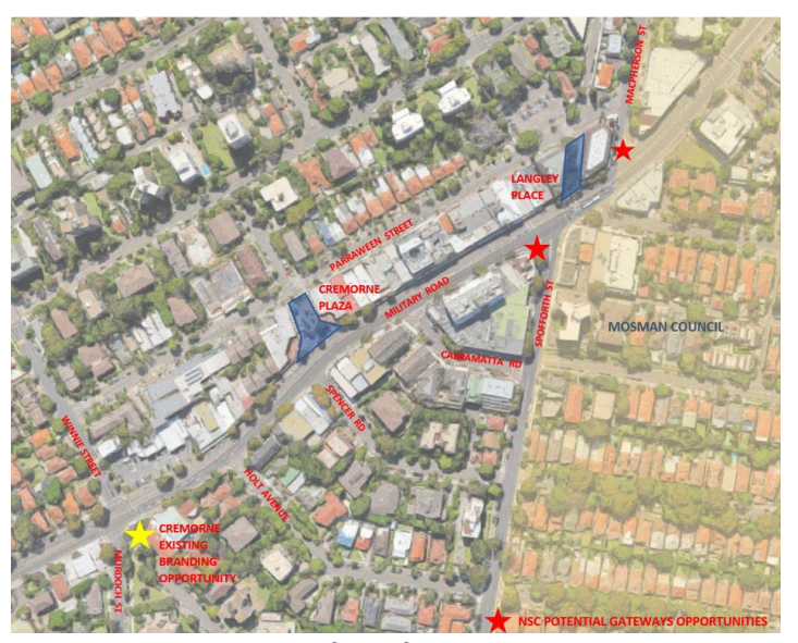
Project Locality Plan

Additionally, Council is currently trialling 30 minutes parking in Parraween Street. As far as the parking meters as a general help indicator, Council still has 2017/18 street parking utilisation levels across the whole LGA, this indicates there isn't as many people returning to the village centres as well as the North Sydney Centre as a lot more people are working from home this being a permanent change in the culture. Council are looking at the parking meters as to what we were doing in 2017/18, and it seems we have gone back five years. Parking meters are a good indicator to measure people coming in the area to our village centres and North Sydney CBD.