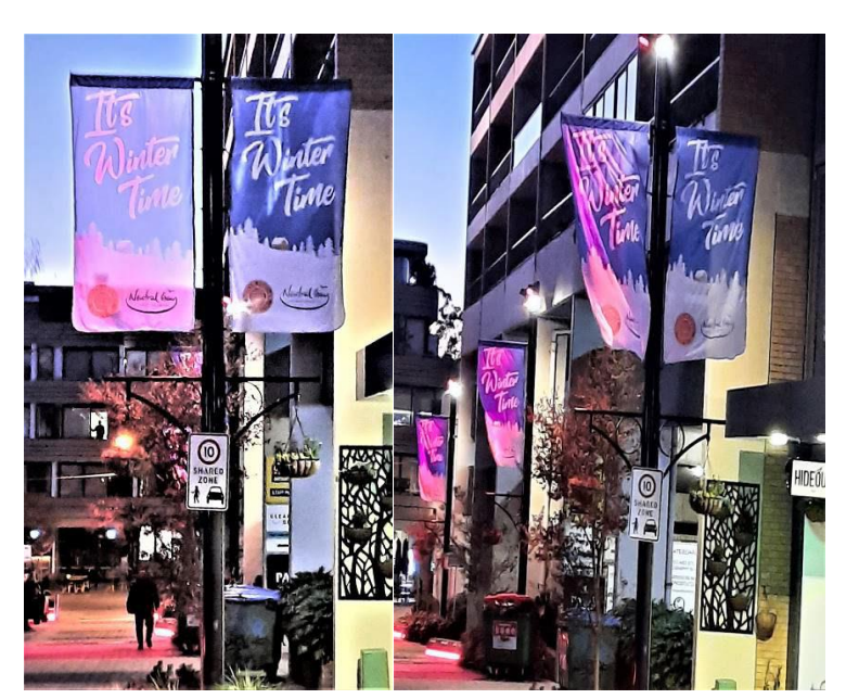
Shop local banners will be installed in the next few weeks.

Council will look into why they are the shorter banners.