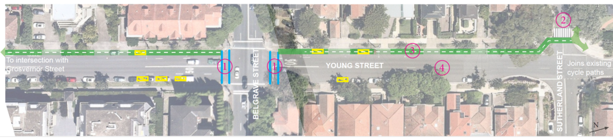
FIGURE 1. Layout plan showing key project features (yellow boxes indicate loss of parking space locations because of traffic signal upgrade