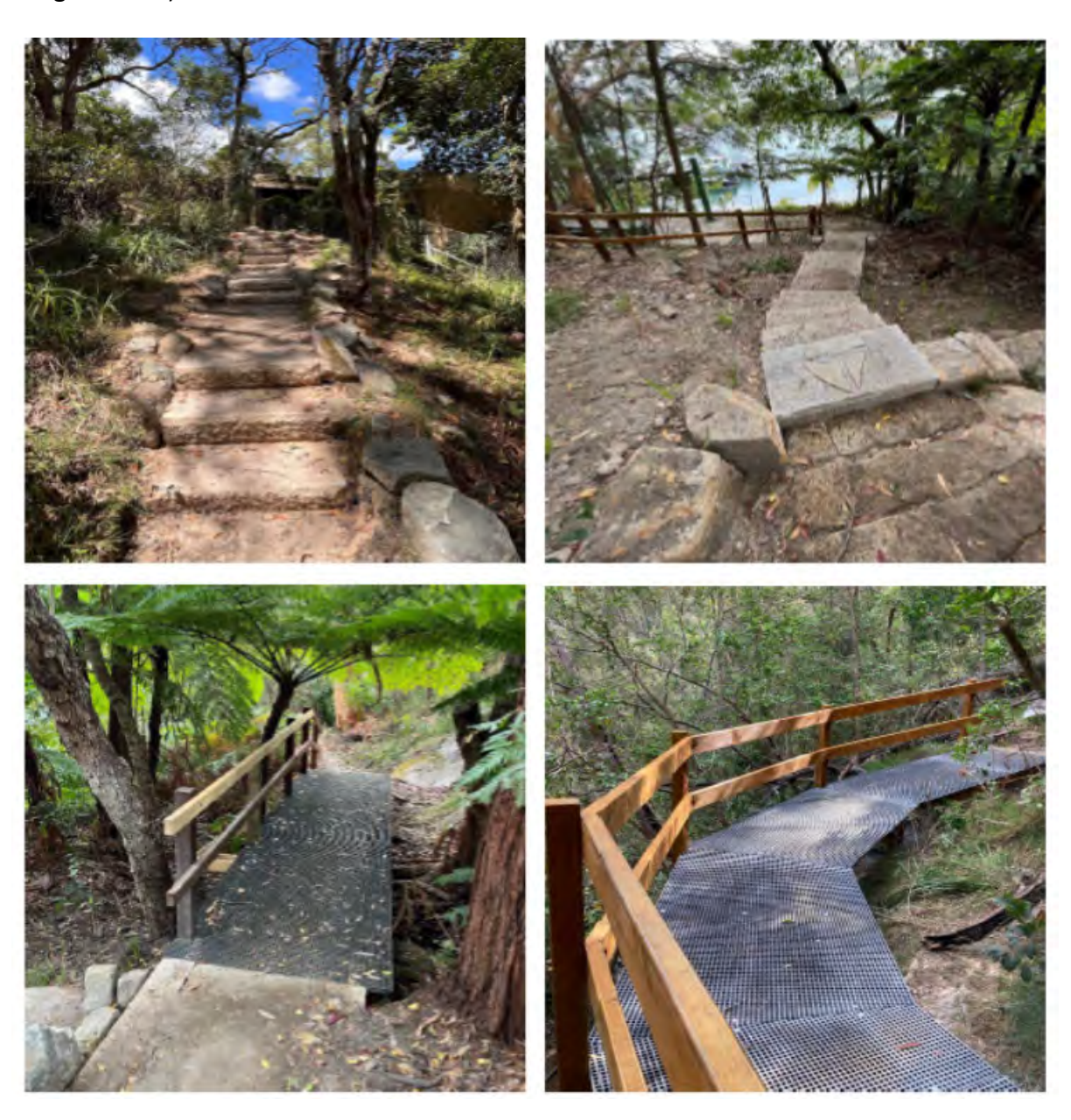
Stage 2 of the project will focus on a relatively inaccessible 650 lineal metre section of the track that is north of the track entrance from Shirley Road, Wollstonecraft. Delivering the heavy sandstone block materials to where they are needed along this section of the track, without causing damage and disturbance to bushland vegetation, presented a major challenge to the project. To overcome this issue, Council engaged a specialist aerial operations contractor to deliver the required materials by helicopter.

Stage 1 of the upgrade project was completed in late January 2023, delivering over fifty sandstone steps, water-bars, a new raised boardwalk, and a refurbished footbridge (see images below).