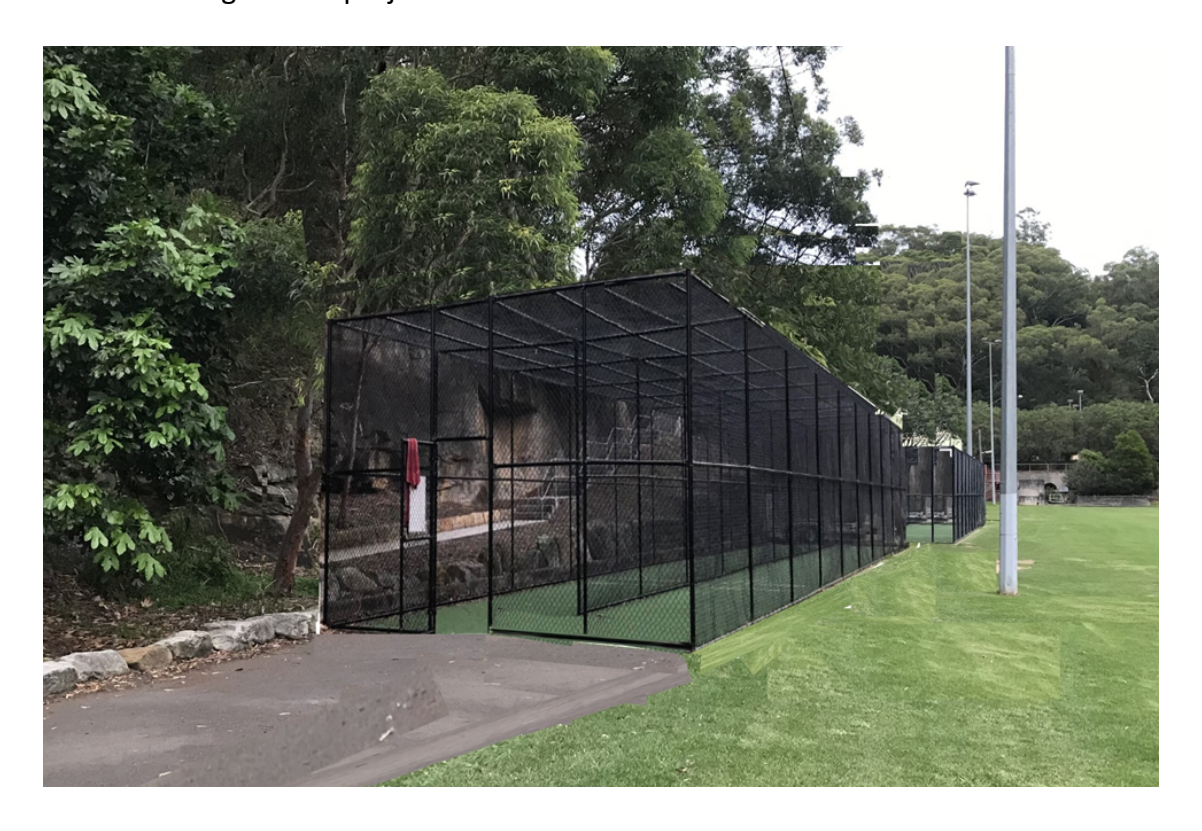
Stage 4 - St Leonards Park Landscape Masterplan Implementation

North Sydney District Junior Cricket Club and the North Shore Junior Cricket Cricket Association are also donating another $30,000.00 between them that will be utilised as additional funding for this project.