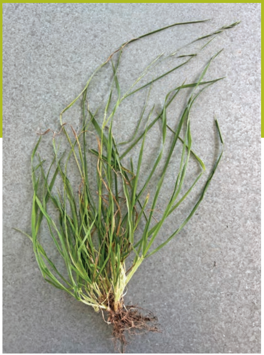
Caption: Prairie Grass ( Bromus catharticus) seedheads at Makawao, Maui