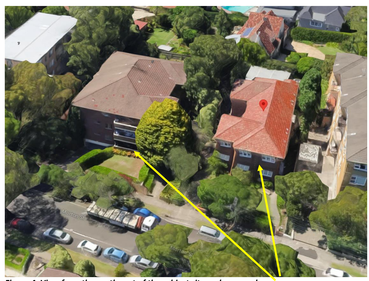
Figure 4. View from the southwest of the subject site and surrounds