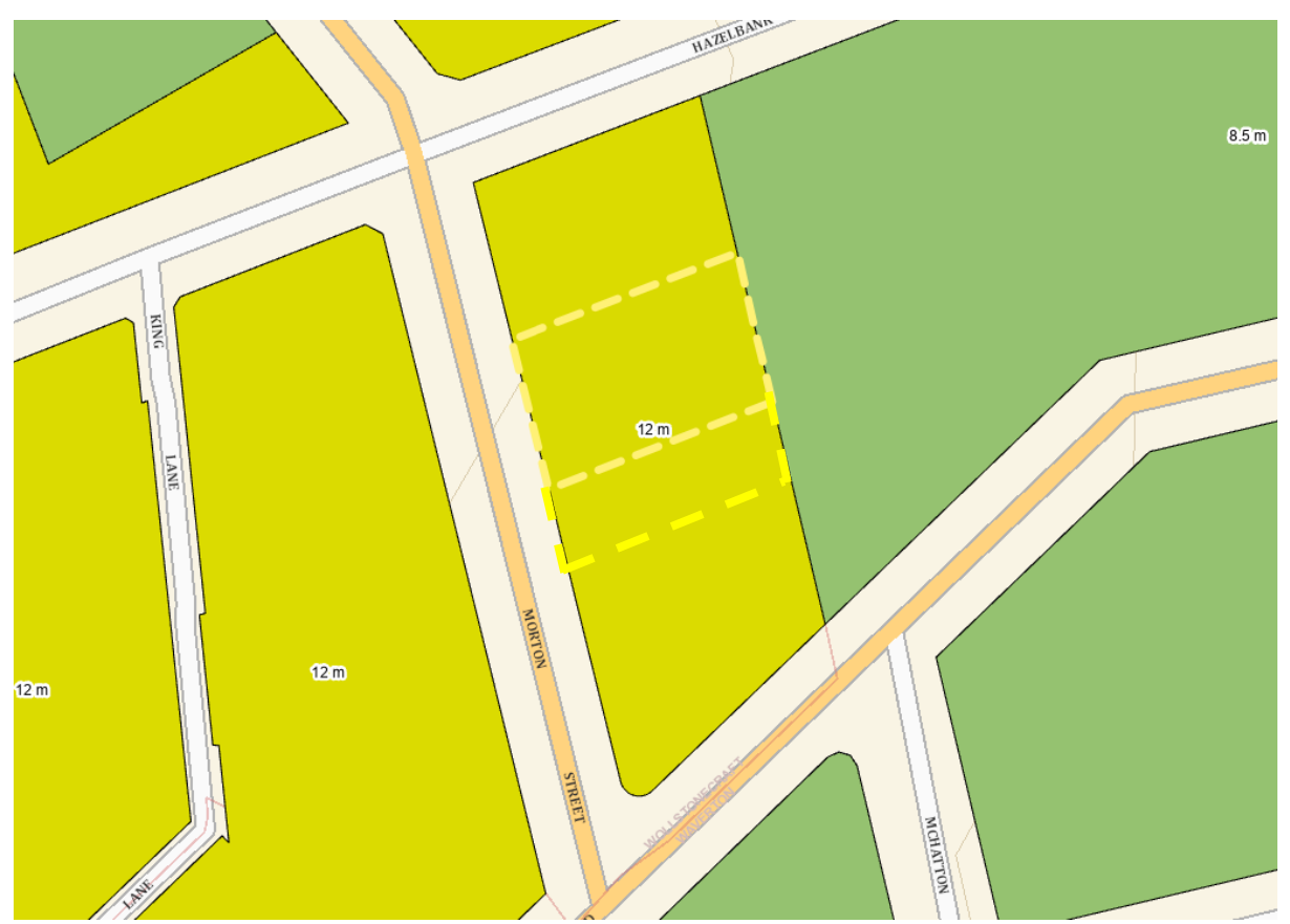
Figure 6. NSLEP 2013 Height of Buildings maps within the subject site shown crosshatched in red.

The site has a maximum permitted building height of 12m pursuant to subclause 4.3(2) in NSLEP 2013.