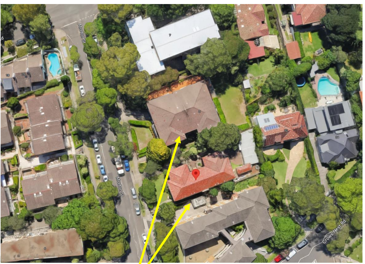
Figure 3. Aerial Image of the subject site and surrounds (includes brown roofed building to north)