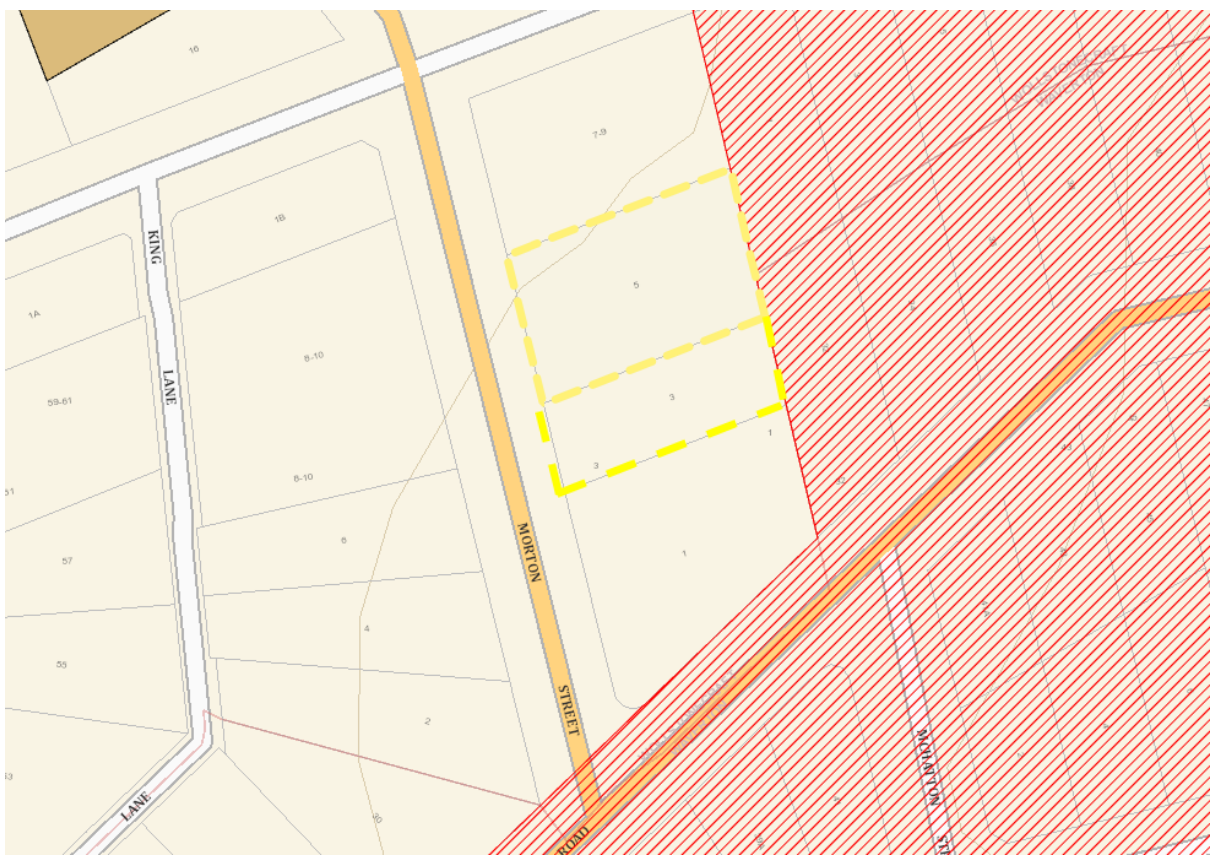
Figure 7. NSLEP 2013 Schedule 5 Heritage items (Conservation Area hatched)