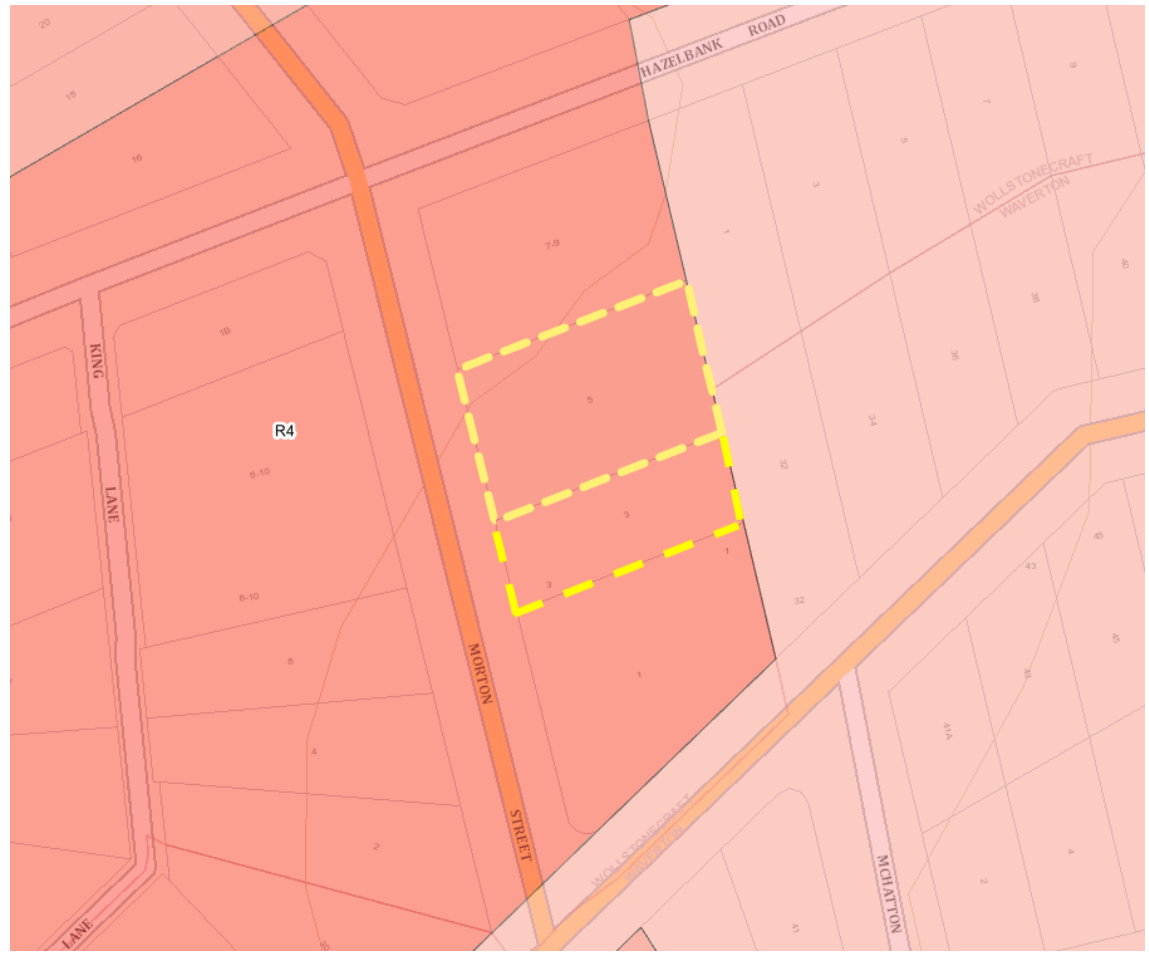
Figure 5. NSLEP 2013 Land use zoning map with the subject site shown outlined in yellow.