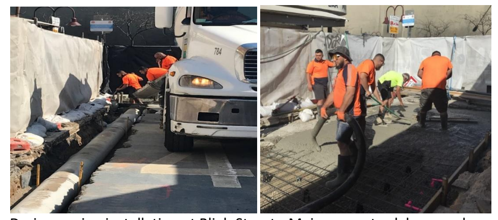
Drainage pipe installation at Bligh Street Main concrete slab poured