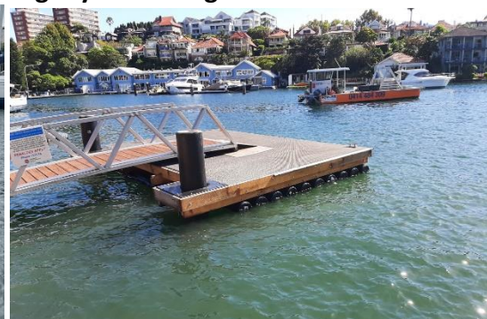
Wrixton Park Pontoon – Before