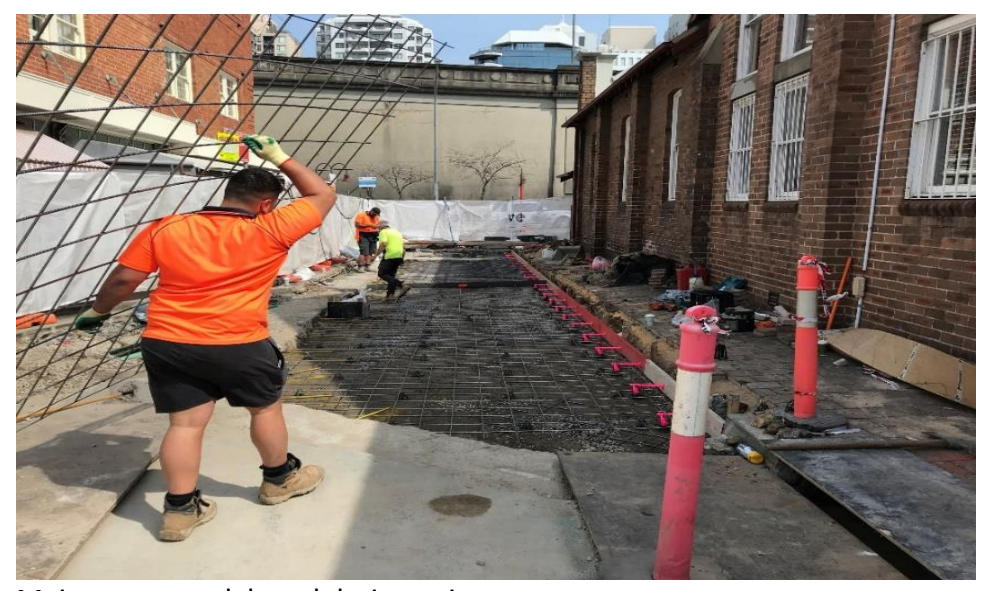
Main concrete slab and drainage in progress