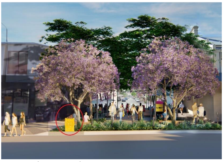
Proposed Memorial Location – Burton Street