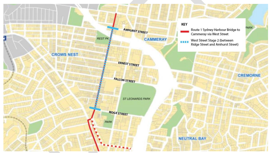
Image 1. Context map West Street Cycling, Walking and Streetscape Upgrades Stage 2

The West Street Cycleway is a part of a key cycling connection identified in both Council and State strategies.