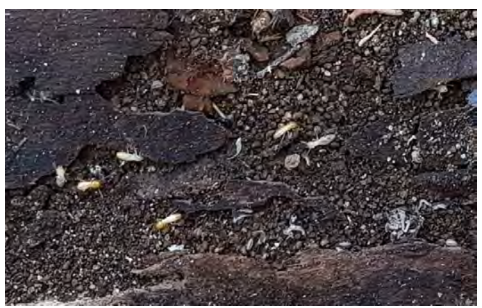
Termites found in timber marine structure