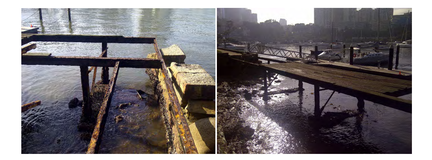
Neutral Bay Jetty – Currently closed