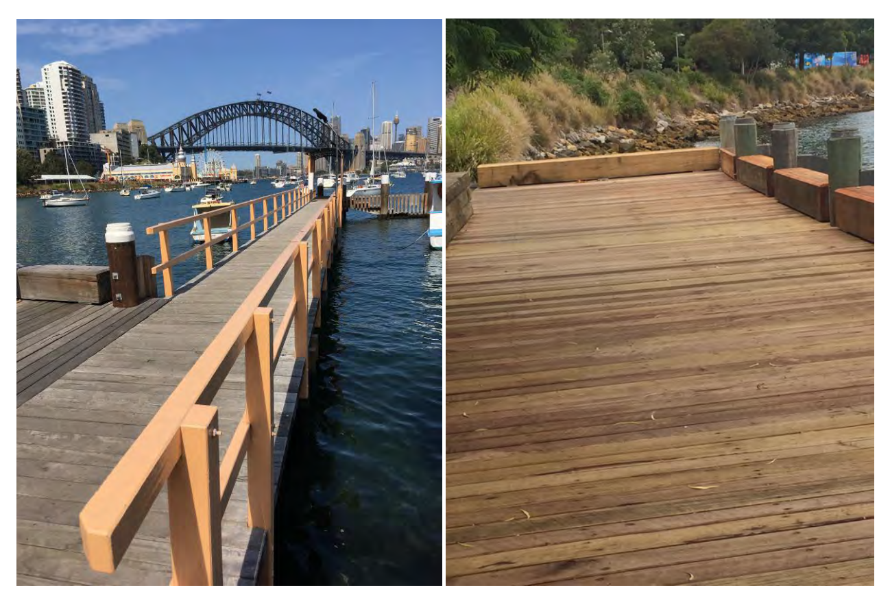
Lavender Bay Wharf and Boardwalk – After – Completed 2017