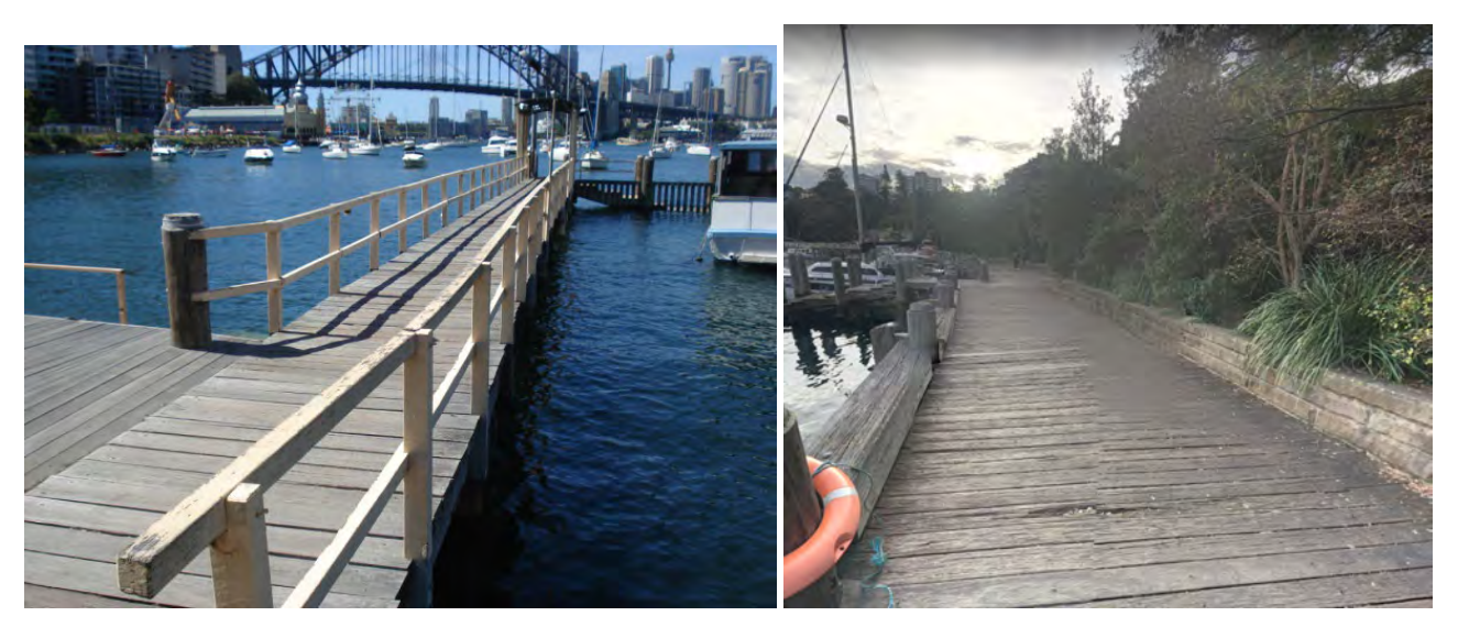
Lavender Bay Wharf and Boardwalk - Before