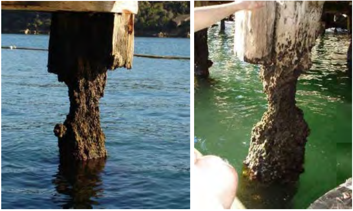
Examples of piles in very poor condition