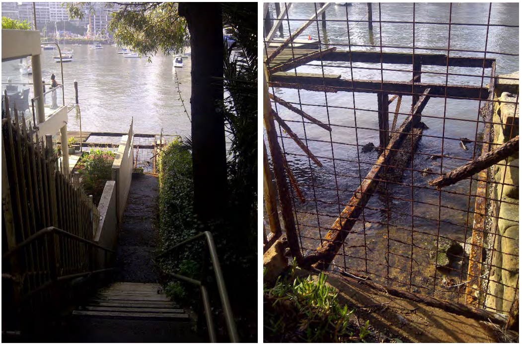
East Crescent Street Jetty - Currently closed