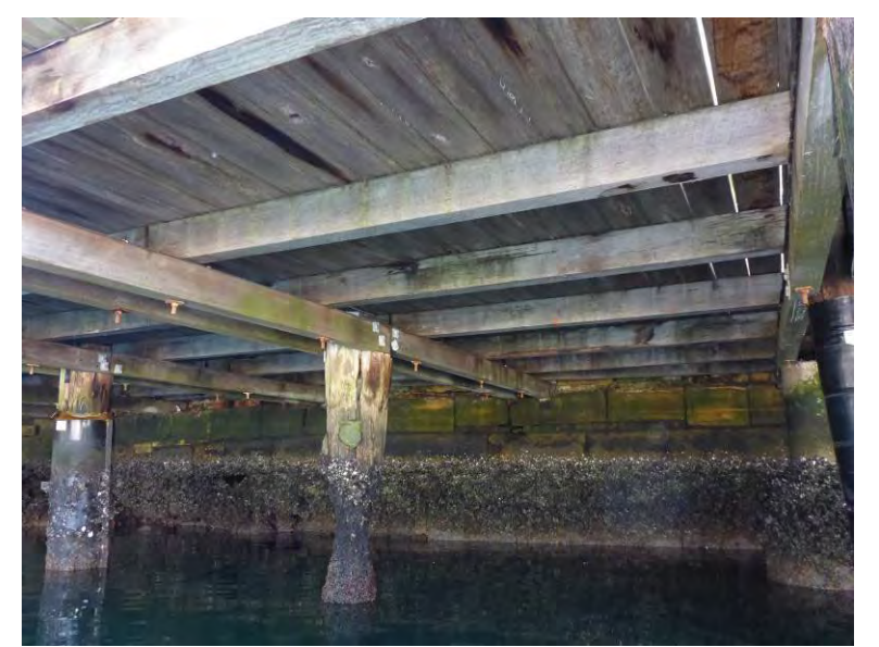
Examples failing timber piles – Wondakiah wharf