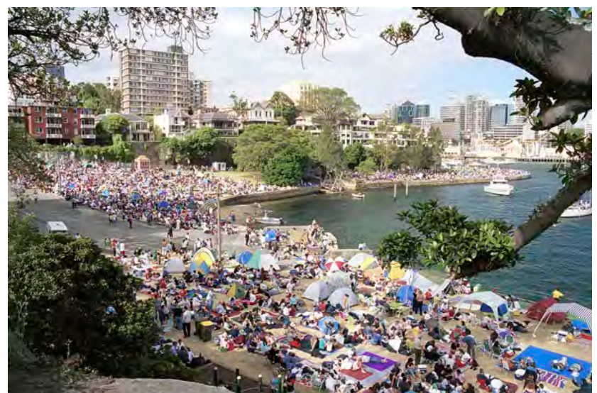
Examples of crowded foreshore on New Years Eve in the North Sydney LGA - Blues Point

Council will endeavour to manage these risks within available funding by prioritising marine structure renewal works based on the North Sydney Council Marine Structures Condition Audit prepared by Consultants, Manly Hydraulics Laboratory.