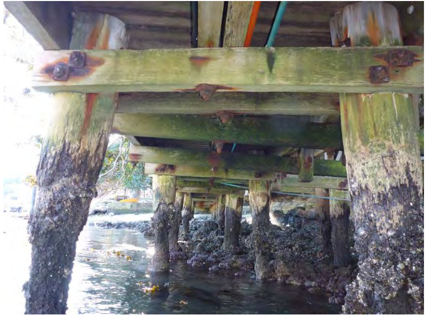
Examples timber piles – Hayes Street Boardwalk – Currently closed