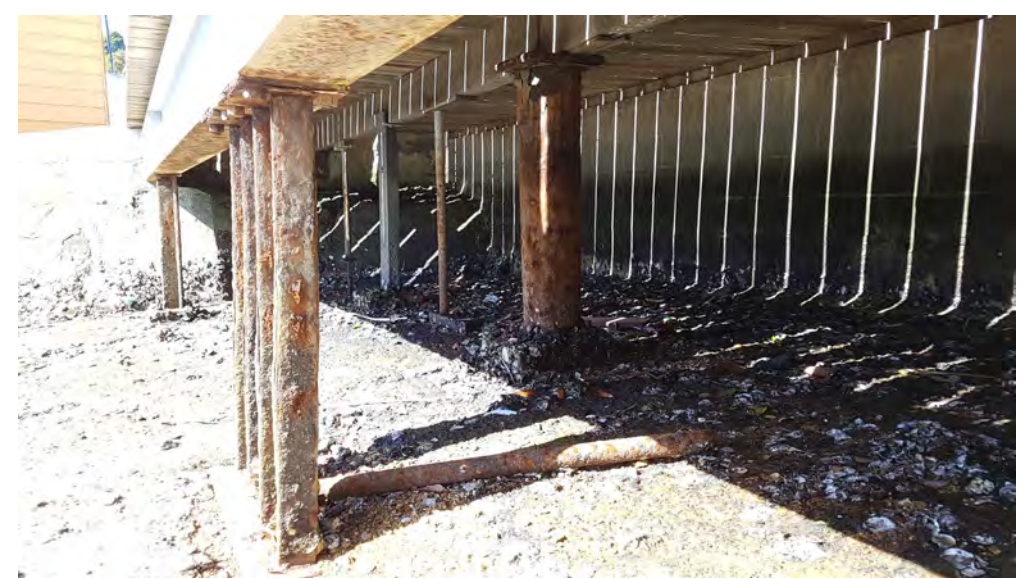
Examples failing steel piles – Boatbuilders Walk Bridge