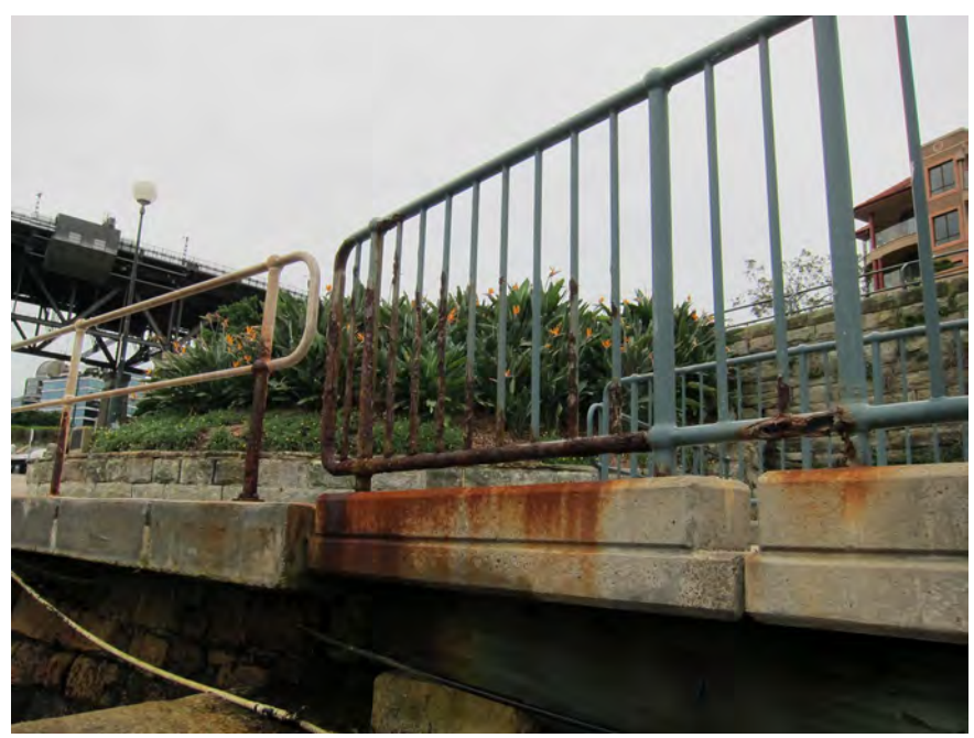
Examples corroding fence – Jefferys Street Bridge