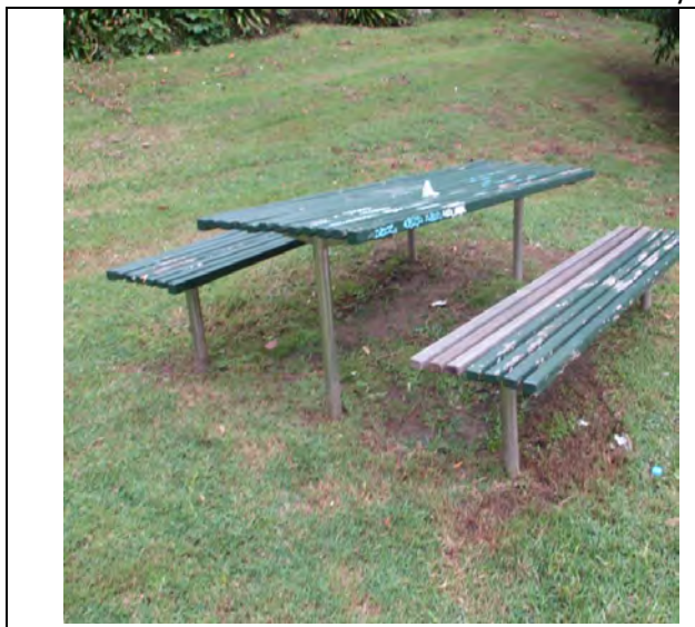
Examples of failed and failing Park Furniture, Playgrounds, Sporting Infrastructure assets in the North Sydney LGA