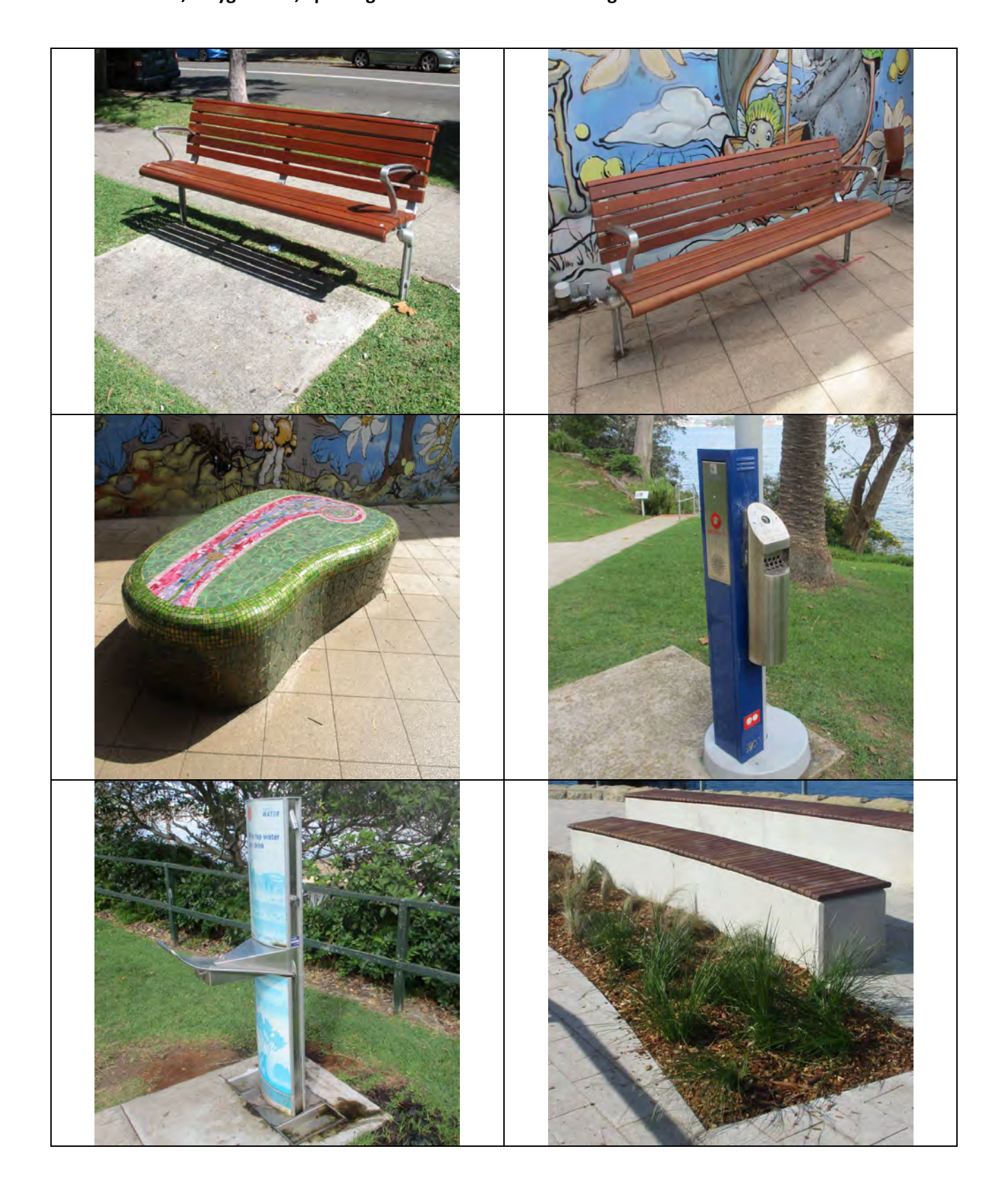
Park Furniture, Playgrounds, Sporting Infrastructure Renewal Program