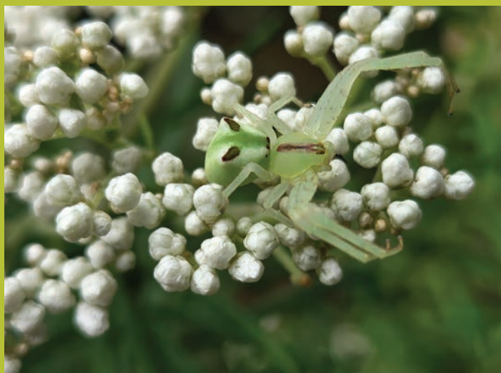
Caption: Crab Spider Sidymella sp. on Paper Daisy ( Ozothamnus diosmifolius ) at Brightmore Reserve by Anne Pickles.

For a full list of species, or to enter your own, go to northsydney.nsw.gov.au/WildlifeWatch or search for Wildlife Watch on our website and click on ‘Submit or view sightings’.