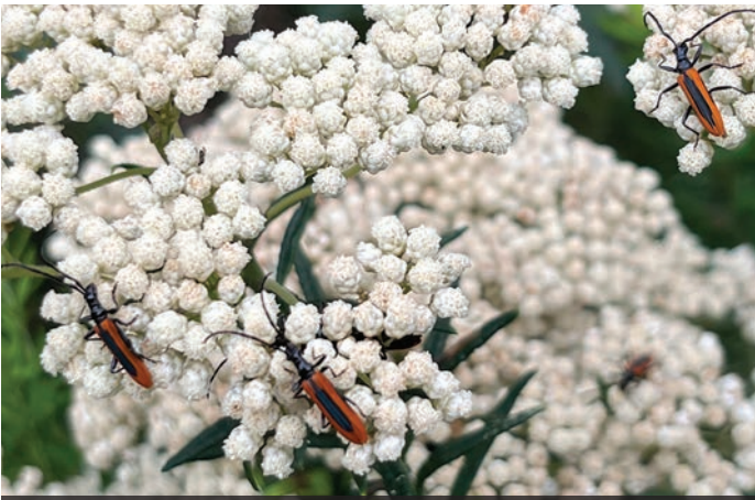
Caption: Everlasting ( Ozothamnus diosmifolius ) flowers with Stinking Longhorn ( Stenoderus suturalis ) at Tunks Park East by Clare McElroy.

Like other species in the Asteraceae (daisy) family, Ozothamnus flowers are attractive to a wide range of insects, and the plant is an excellent addition to native gardens. These plants are fast-growing and easy to cultivate (though relatively short-lived) and grow best in full sun on enriched sandy or clay soil with good drainage.