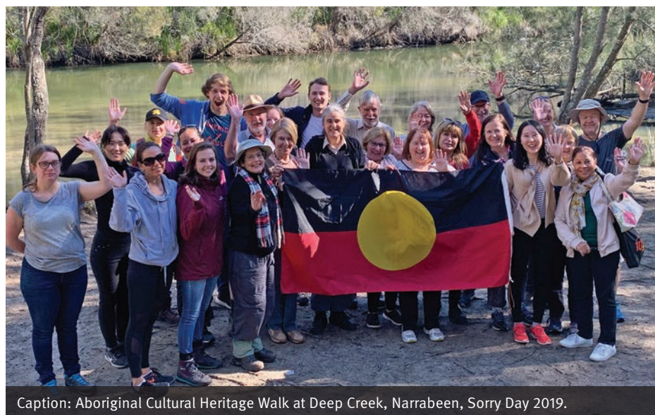
Caption: Aboriginal Cultural Heritage Walk at Deep Creek, Narrabeen, Sorry Day 2019.