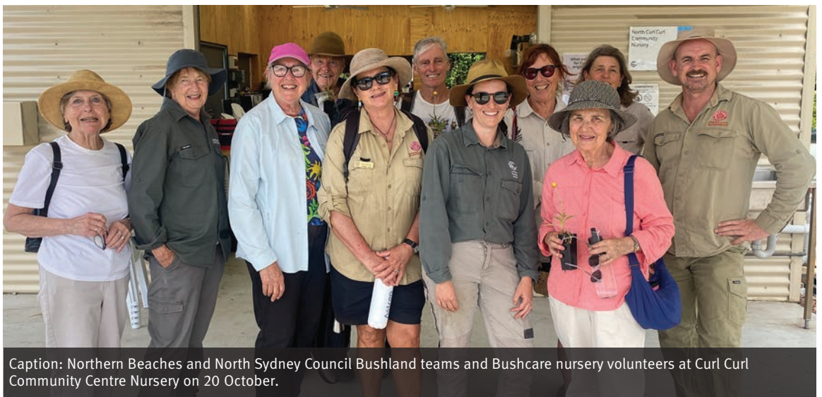
Caption: Northern Beaches and North Sydney Council Bushland teams and Bushcare nursery volunteers at Curl Curl Community Centre Nursery on 20 October.

by Clare McElroy – Bushcare Nursery Supervisor