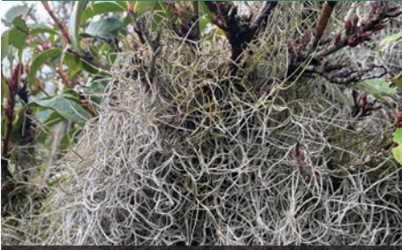
Caption: Spanish Moss ( Tillandsia usneoides ) on the corner of Ernest Street and Park Avenue, Cremorne.

In the Spring 2025 Bushcare Newsletter, our ‘Weed to Watch’ article focused on Spanish Moss ( Tillandsia usneoides ), an epiphytic plant that appears to be spreading in Sydney and, in some instances, having a negative impact on host trees. To understand the spread of Spanish Moss in North Sydney, we asked readers to log your Spanish Moss observations in iNaturalist. As you can see from the map above, many reports on the northeast side of our council