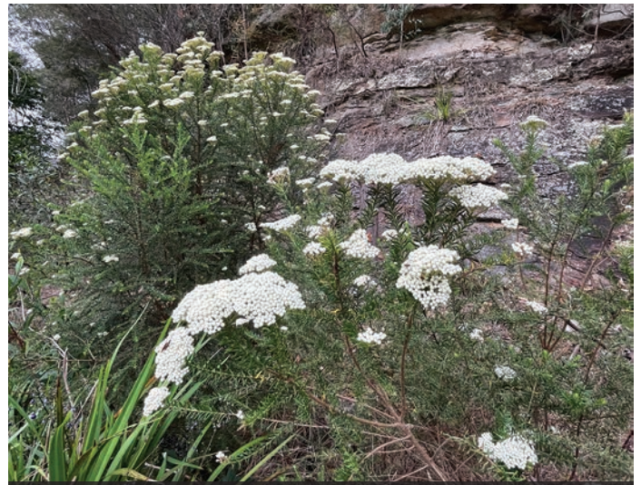
Caption: Everlasting ( Ozothamnus diosmifolius ) at Tunks Park East by Clare McElroy.