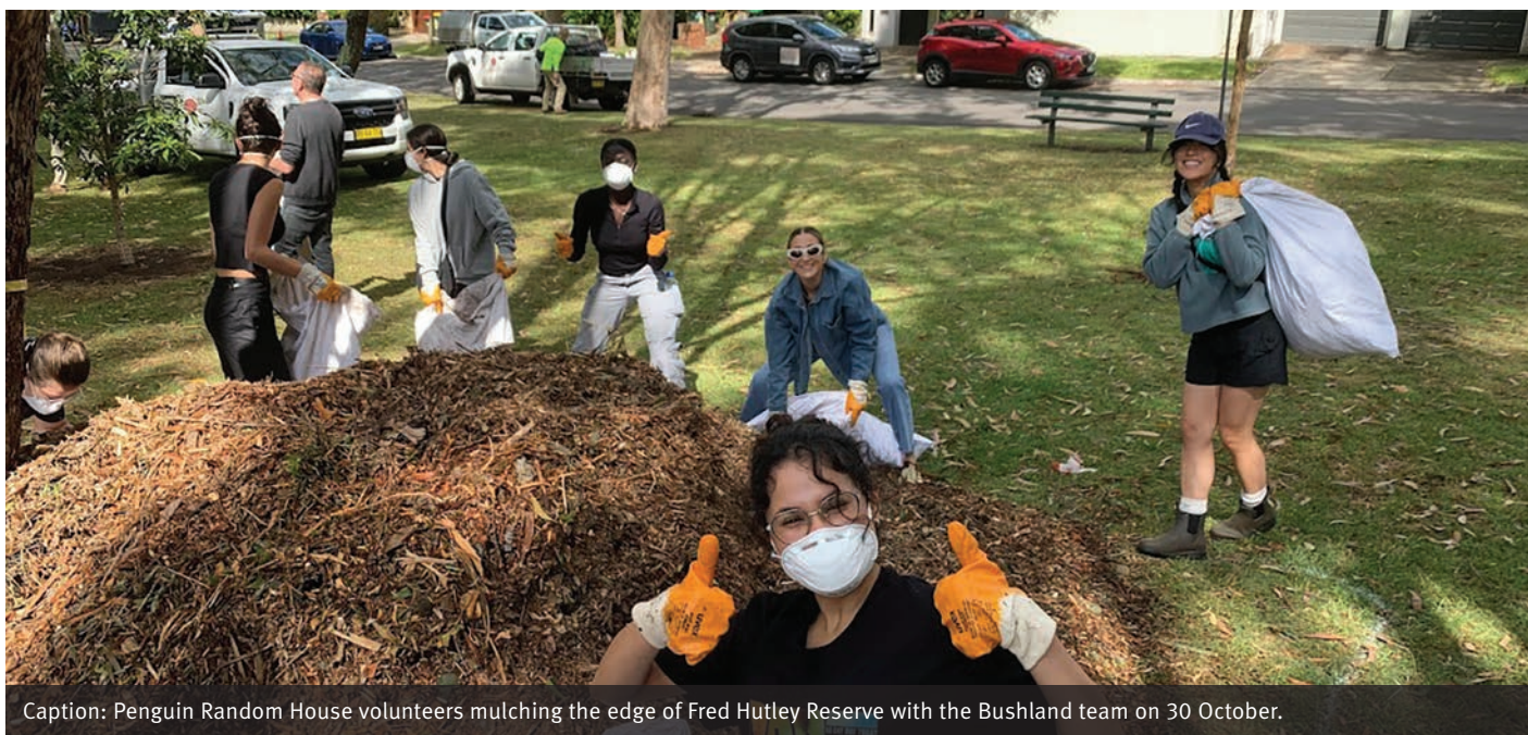
Caption: Penguin Random House volunteers mulching the edge of Fred Hutley Reserve with the Bushland team on 30 October.

Through mulching, weeding and planting new trees, Penguin Random House staff can have a positive impact on our environment. It is extra special when we get to come back to the same spaces and see our hard work from years prior. Thank you to North Sydney Council for being so excellent to work with!