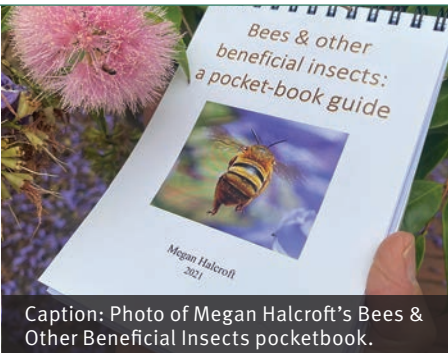
Caption: Photo of Megan Halcroft’s Bees & Other Beneficial Insects pocketbook.

log your observations in the iNaturalist app. Don’t forget to include the host tree species in the notes if you recognise it and/or include a photo. If you need a hand using iNaturalist, please reach out to our Bushland Project Officer on 9936 8100.