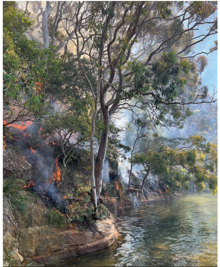
Caption: Low-intensity burn along the Badangi Reserve foreshore on 10 October 2025.