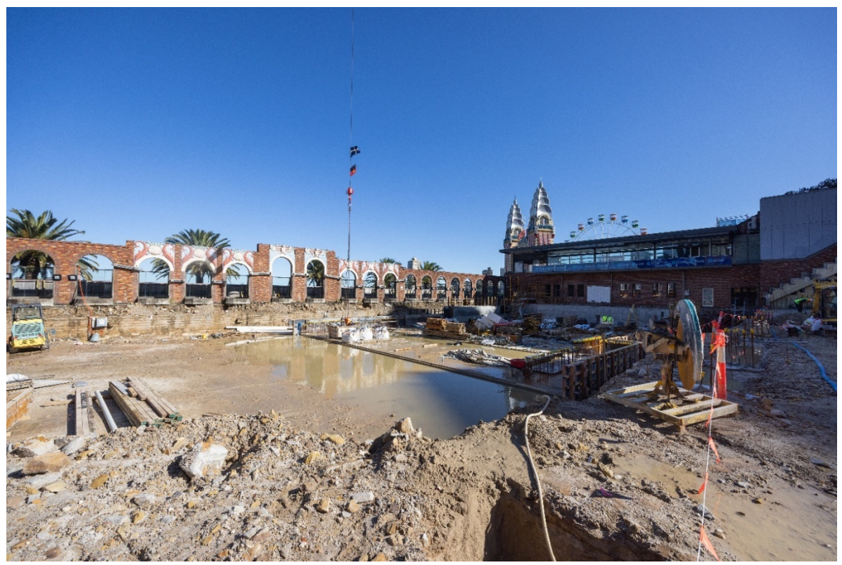
50m pool 08/07/2022