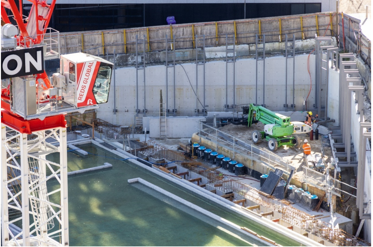
The old Hopkins Park 08/07/2022