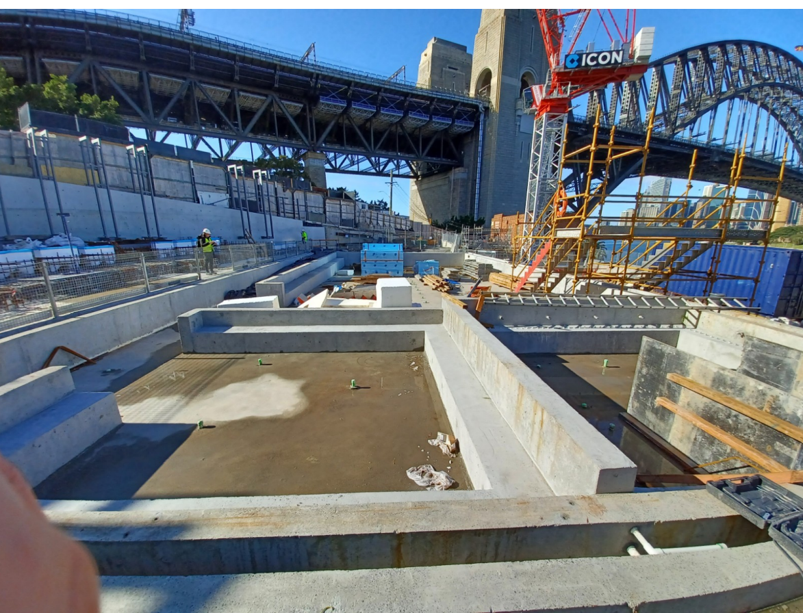
Program pool with Spa 24/08/2022