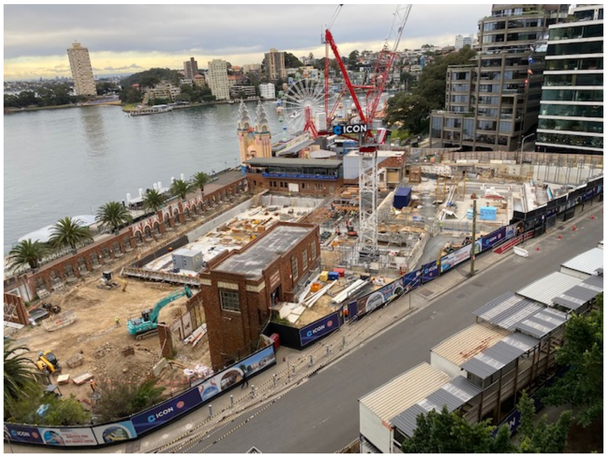
View from the Sydney Harbour Bridge 19/8/2022