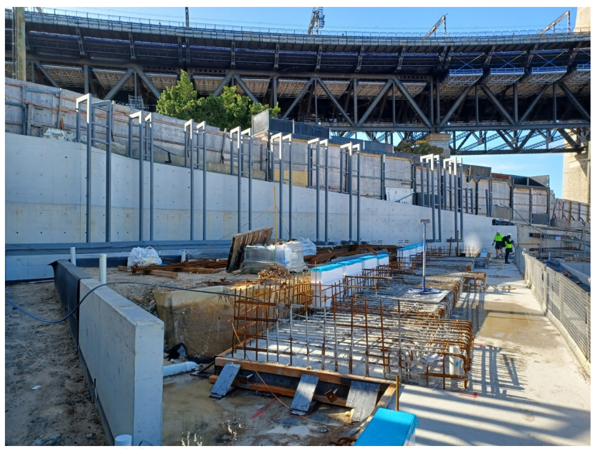
The old Hopkins Park 24/08/2022