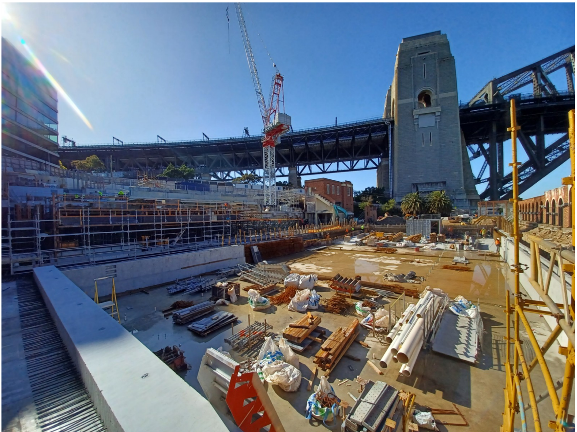
50m pool 24/08/2022