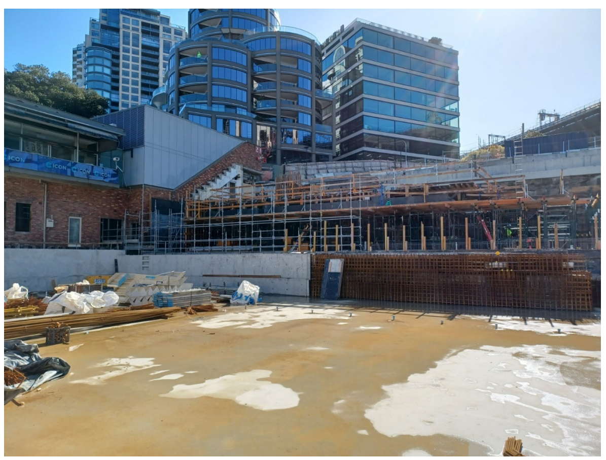
Grandstand level 2 formwork 24/08/2022