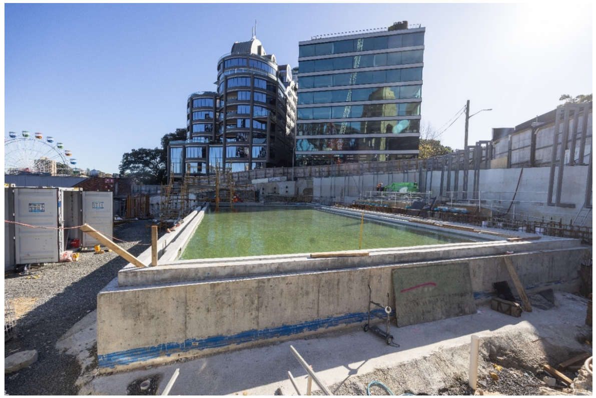
Program pool leak testing under way 08/07/2022