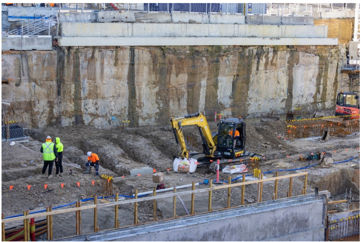
Grandstand inground services underway 08/07/2022