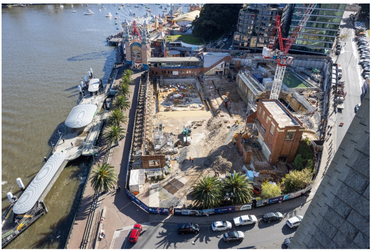
View from the Sydney Harbour Bridge 8/7/2022