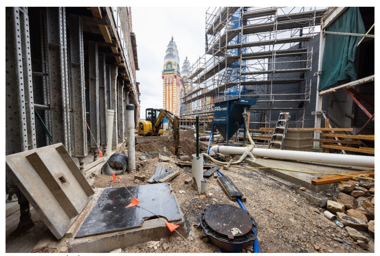
Western Stairs 21/10/2022