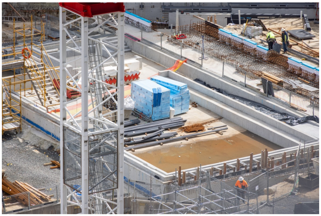
View from the Sydney Harbour Bridge 15/09/2022