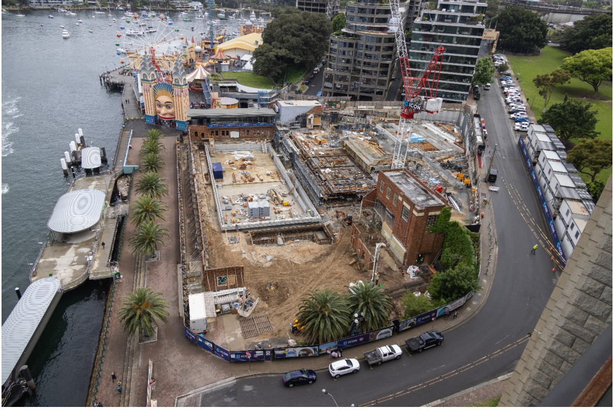
View from the Sydney Harbour Bridge 21/10/2022