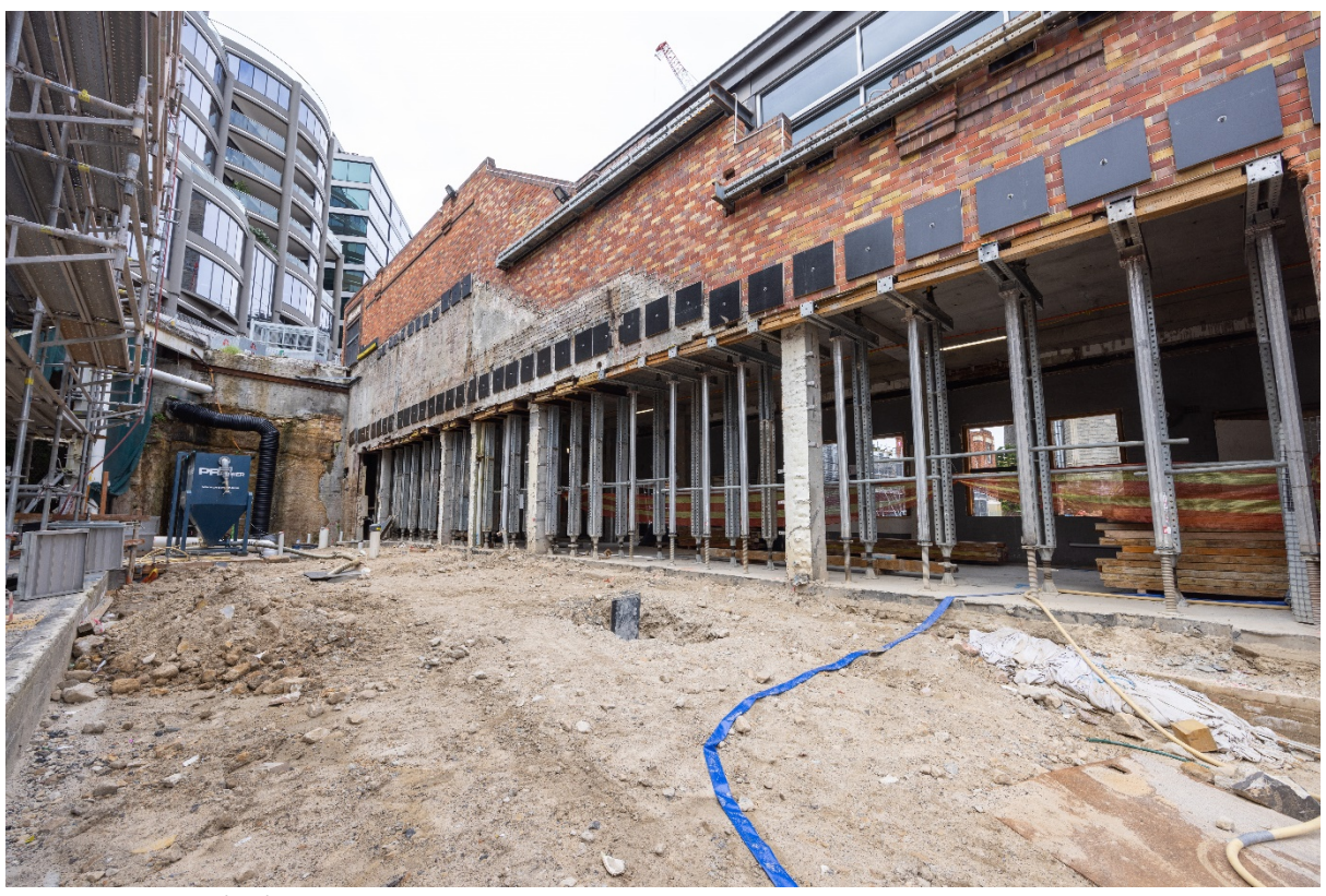
Western Stairs 15/09/2022