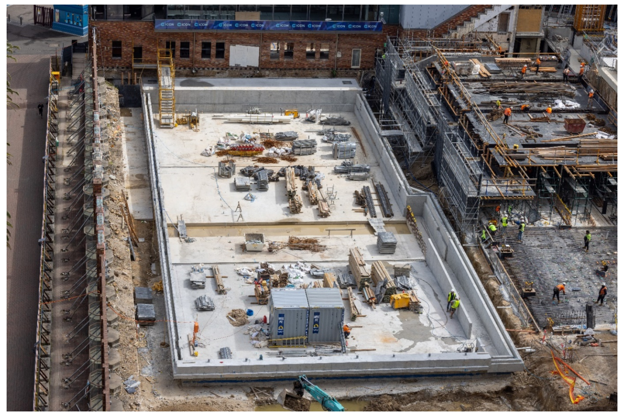
View from the Sydney Harbour Bridge 15/09/2022