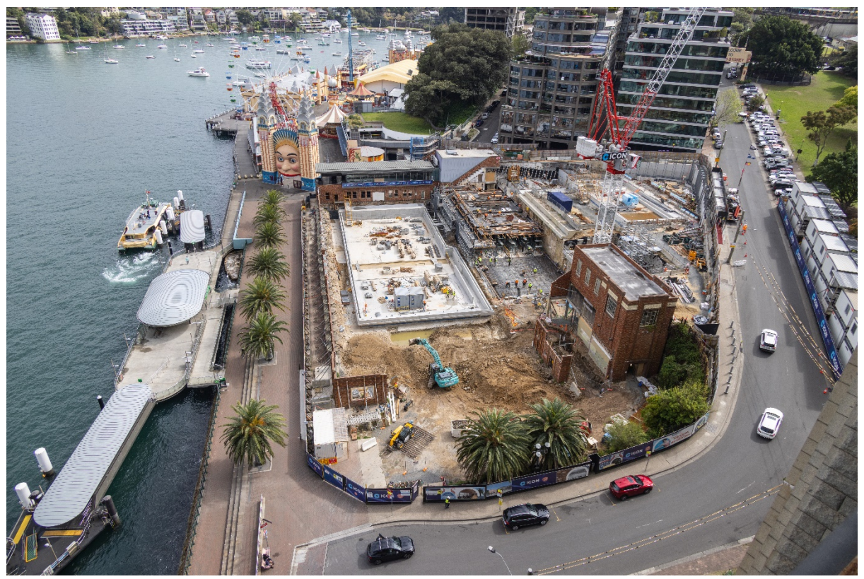
View from the Sydney Harbour Bridge 15/09/2022