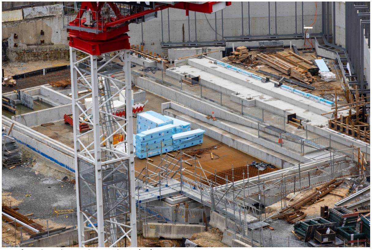
View from the Sydney Harbour Bridge 21/10/2022