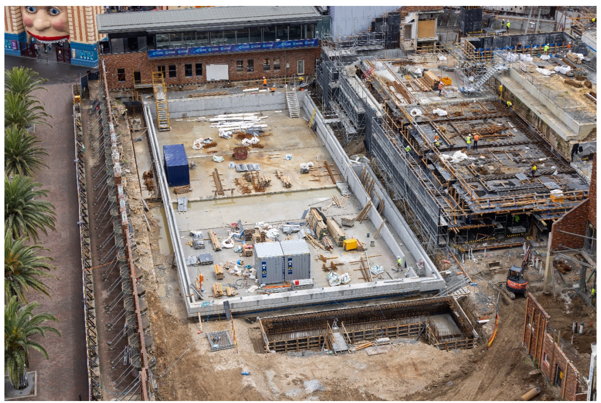
View from the Sydney Harbour Bridge 21/10/2022