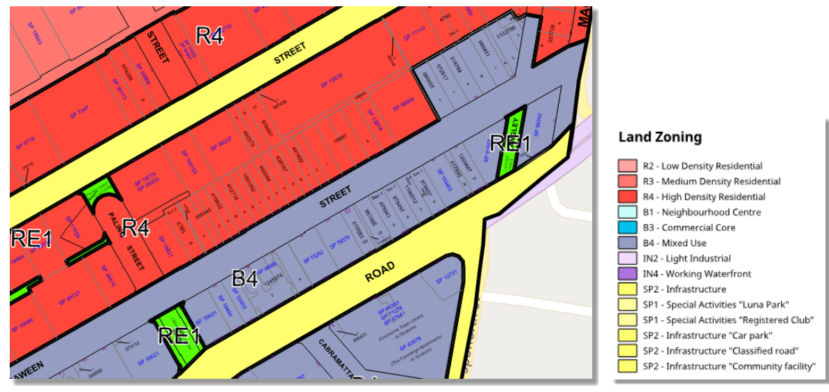
Figure 1 – Existing Zones (NSLEP 2013)

The height limit associated with this zone on the subject land is 12m as shown below in Figure 2. This generally equates to three to four storeys.