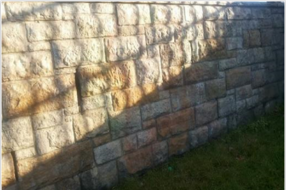
Before and After photos of typical Instance of Graffiti in North Sydney on Council Property – retaining wall Crows Nest