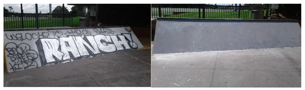
Before and After photos of typical Instance of Graffiti in North Sydney on Council Facilities – Skate Park Plaza, Cammeray