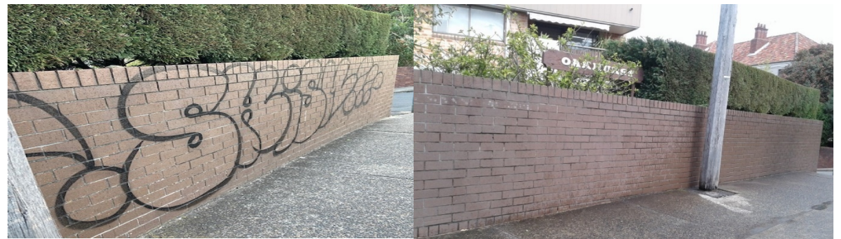
Before and After photos of typical Instance of Graffiti in North Sydney on Private Property -- Manns Avenue, Neutral Bay