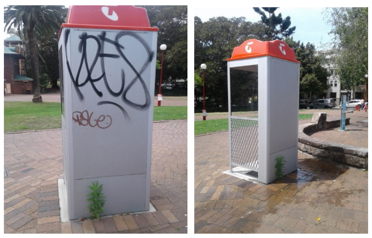
Before and After photos of typical Instance of Graffiti in North Sydney on Telstra Property