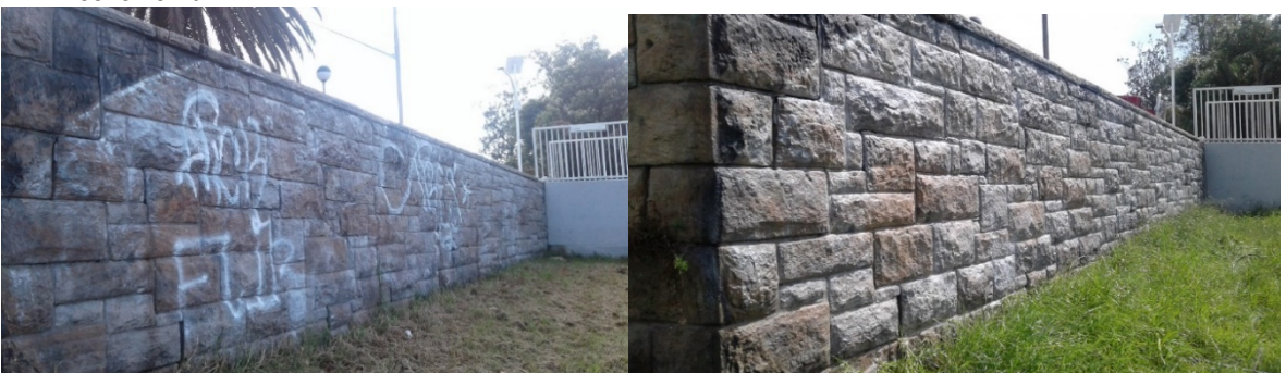
Before and After photos of typical Instance of Graffiti in North Sydney on Public space – Ridge Street Lookout, North Sydney