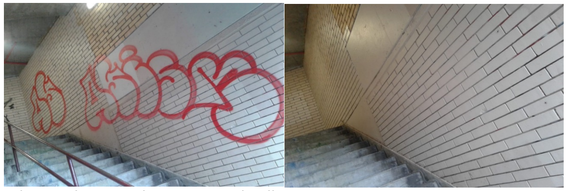
Before and After photos of typical Instance of Graffiti in North Sydney on Public space – pedestrian walkway, North Sydney