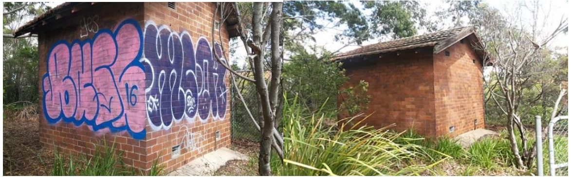
Before and After photos of typical Instance of Graffiti in North Sydney on Utilities