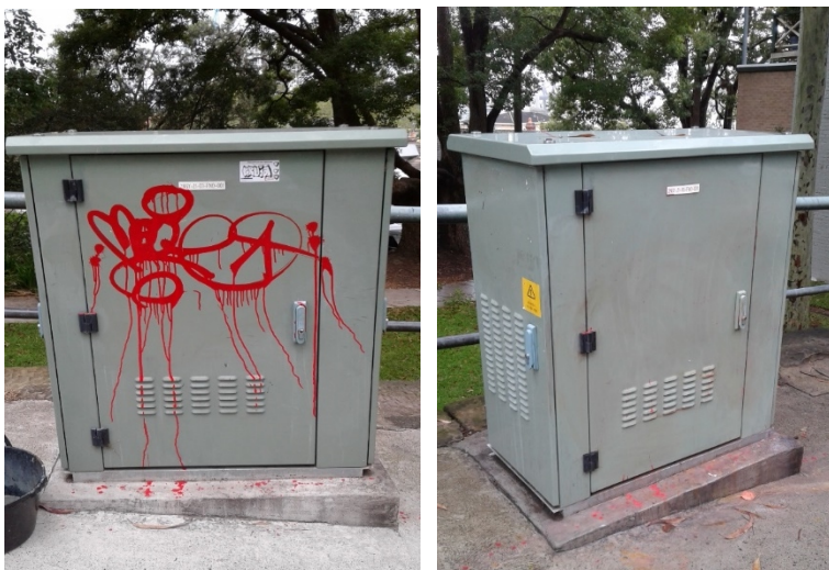
Before and After photos of typical Instance of Graffiti in North Sydney on Telstra Property