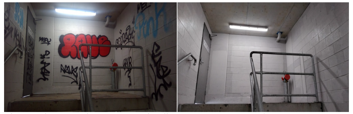
Before and After photos of typical Instance of Graffiti in North Sydney on Council' Parking Station, Alexander Street Carpark, Crows Nest