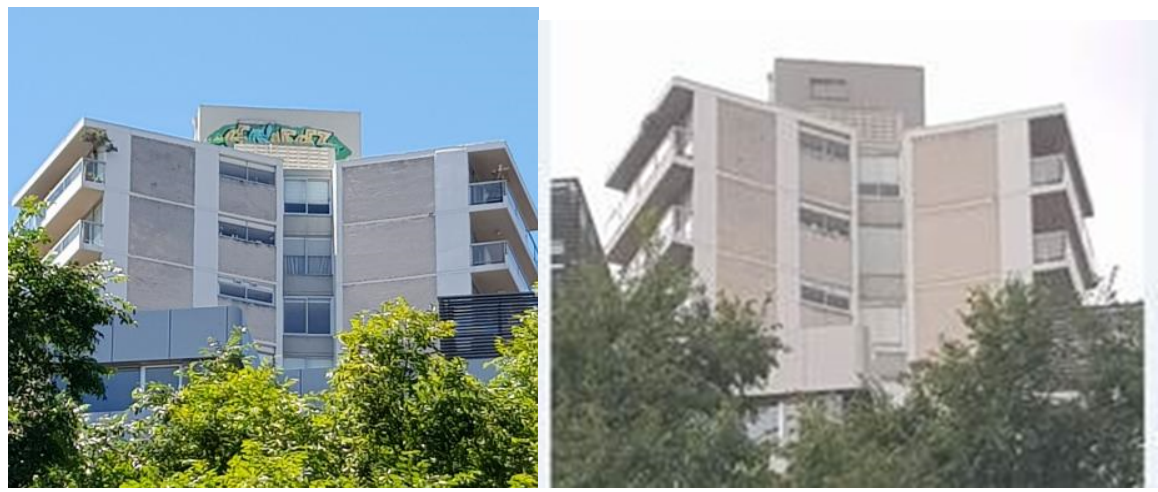
Before and After photos of typical Instance of Graffiti in North Sydney on Private Property – top of lift shaft – units Neutral Bay