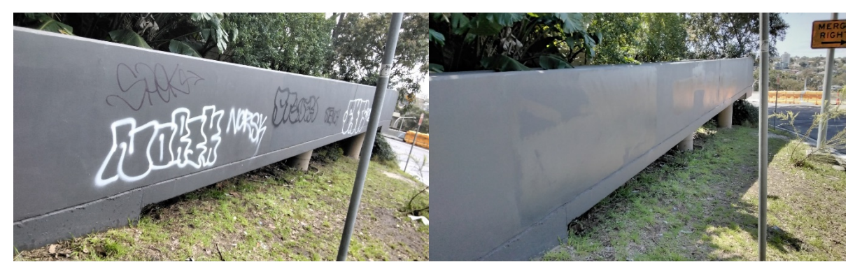
Before and After photos of typical Instance of Graffiti in North Sydney on public spaces – pedestrian walkway, Alfred Street, North Sydney