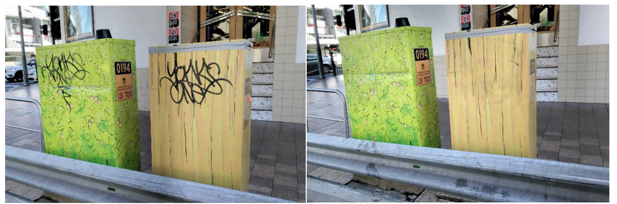
Before and After photos of typical Instance of Graffiti in North Sydney on the RMS Control box – Military Road, Neutral Bay