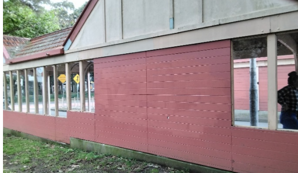
Before and After photos of typical Instance of Graffiti in North Sydney on Council bus shelter – Watson Stand A, Neutral Bay