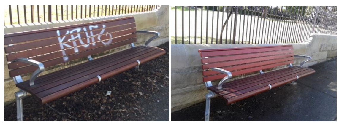
Before and After photos of typical Instance of Graffiti in North Sydney Council Street furniture