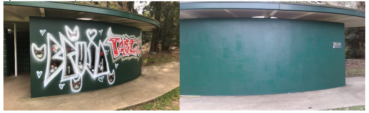
Before and After photos of typical Instance of Graffiti in North Sydney on Council Facilities – Berry Island Reserve, Shirley Road, Wollstonecraft