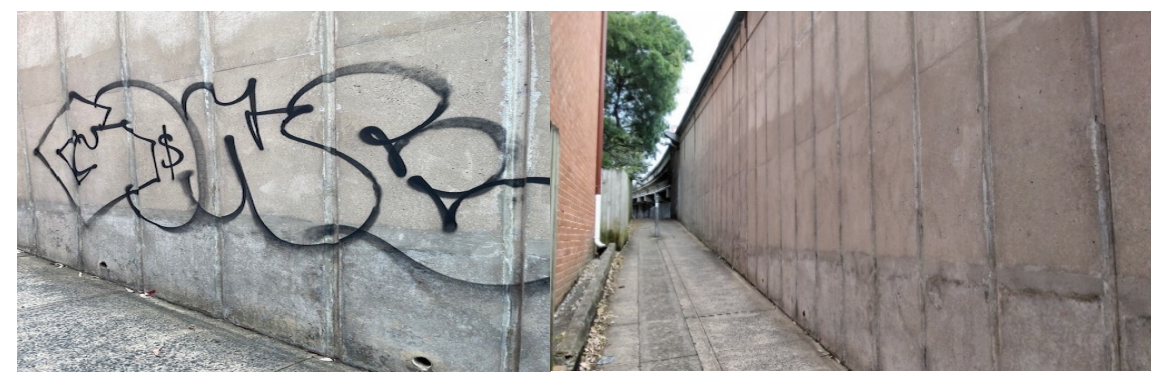
Before and After photos of typical Instance of Graffiti in North Sydney on Public space – Ennis Lane, Milsons Point