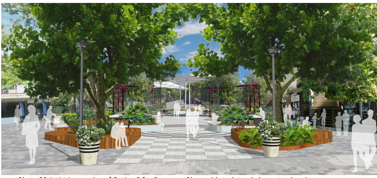
Photo 28 Artist impression of Option 2 for Cremorne Plaza with sculptural element – day view