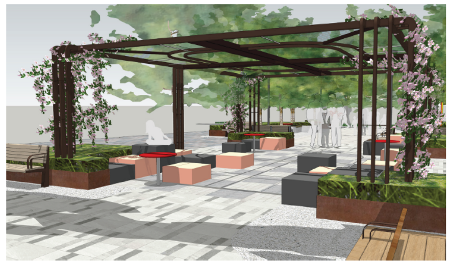
Pergola will be prefabricated from steel referencing art deco patterns; roof panels can be made from perforated or laser cut metal. Playful seating will be provided in this space which will include cafe tables.

Pergola will delineate space and bring in calm and relaxed atmosphere with additional seating. Feature lighting will be added for night-time activation.