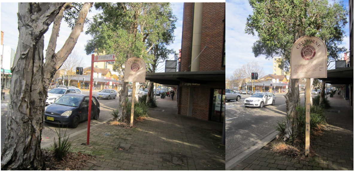
Photo 15 - "Gateway Signage" at the North Sydney – Mosman Council Boundary on Military Road

Located at the corner of Military Road and Murdoch Street this gateway was designed and constructed in 1998, it is outdated and in need of "refreshing". Adjacent to the beautiful and well-maintained Weaver Park this area is the current "Gateway" to the Cremorne Village Centre and North Sydney. This location offers opportunities to highlight the unique character of the area as well as improve the arrival and exit experience to the North Sydney LGA on the Military Road corridor.