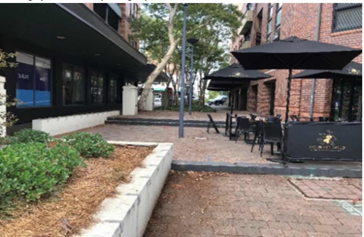
Photo 33 Langley Place existing condition looking from Parraween Street