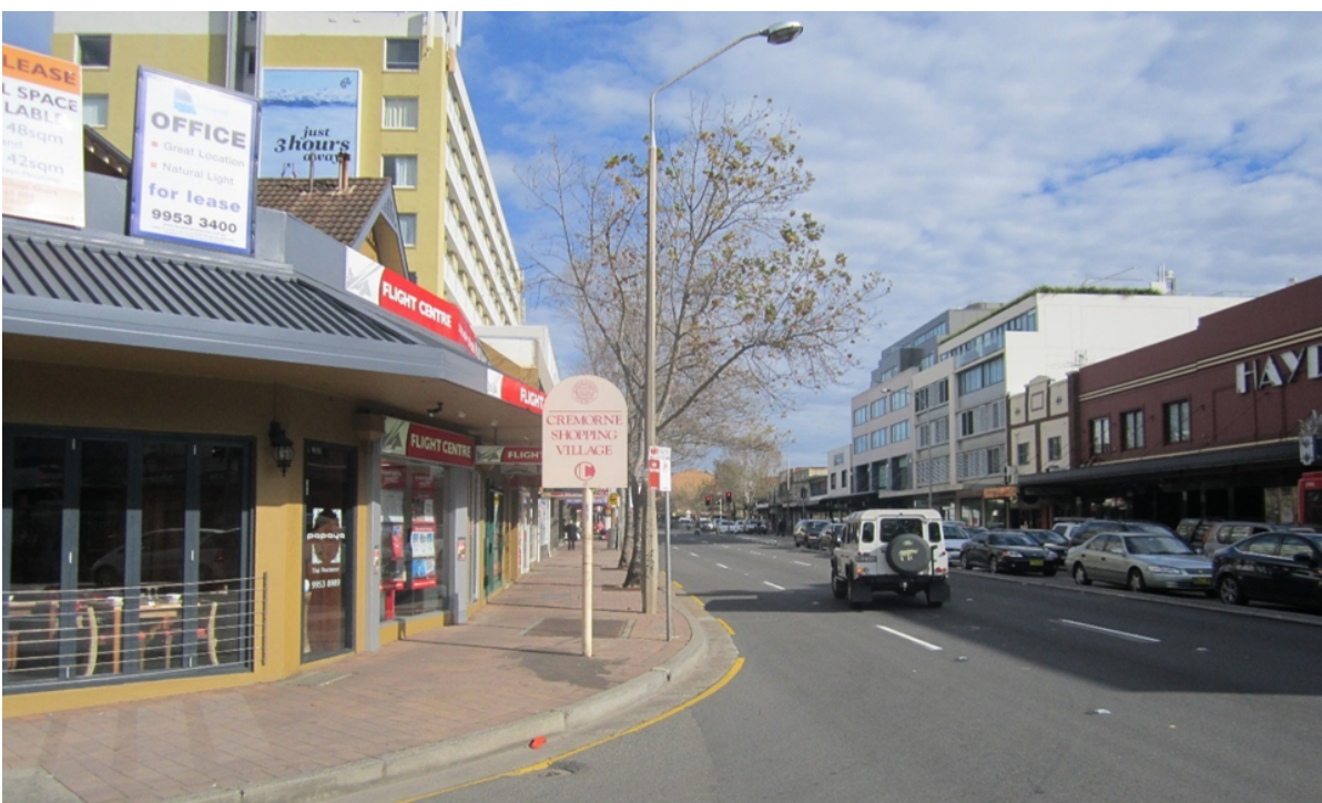
Photo 14 - "Gateway Signage" at the North Sydney - Mosman Council Boundary on Military Road Westbound

architectural/urban design elements, decorative lighting, special planting (Green Walls), public art installations and the like.