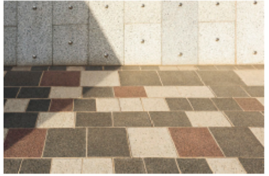
A number of paving patterns inspired by art deco will be used to define spaces

Photo 31 Both options - precedent images for Cremorne Plaza