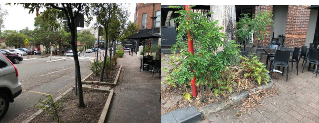
Photos 9-10 Langley Place – unkept planter beds – old paving that is at the end of its useful life

Designed in early 2000, Langley Place in its current state is also looking tired and dilapidated, it is currently used as a pedestrian thoroughfare from Parraween Street to Military Road. This small through site link has large and dark awnings on both buildings, old planting beds and Council's old-style streetscape furniture elements. The thoroughfare is poorly lit at night and contains a number of changes in level. Langley Place requires a complete re-design to make it into a more inviting, safe and accessible public space.