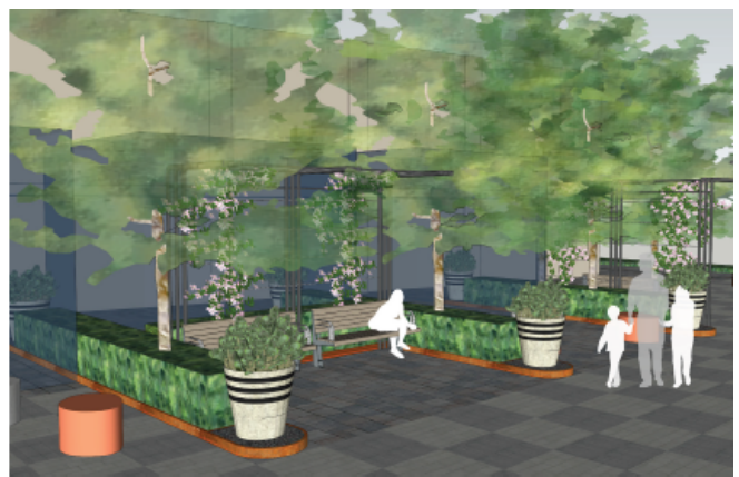
Series of pergolas inspired by art deco will be delineating spaces and provide colour interest with their climbers and offer various forms of seating including standard plaza seats as well as bar stools and tables.