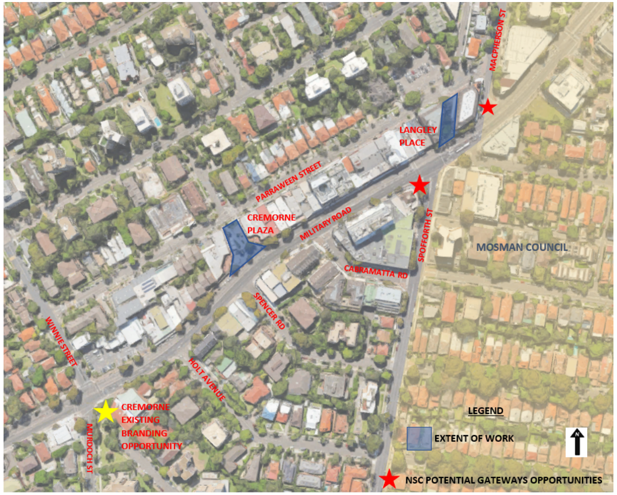
Figure 1 Location plan of Cremorne Plaza and Langley Place Upgrades in Cremorne

All public domain works in the Military Road Corridor funded through the B-Line Funding Deed, with the exception of "Young Street Plaza" have now been completed. Two of the projects that were not funded under deed are the upgrading of Cremorne Plaza and Langley Place.