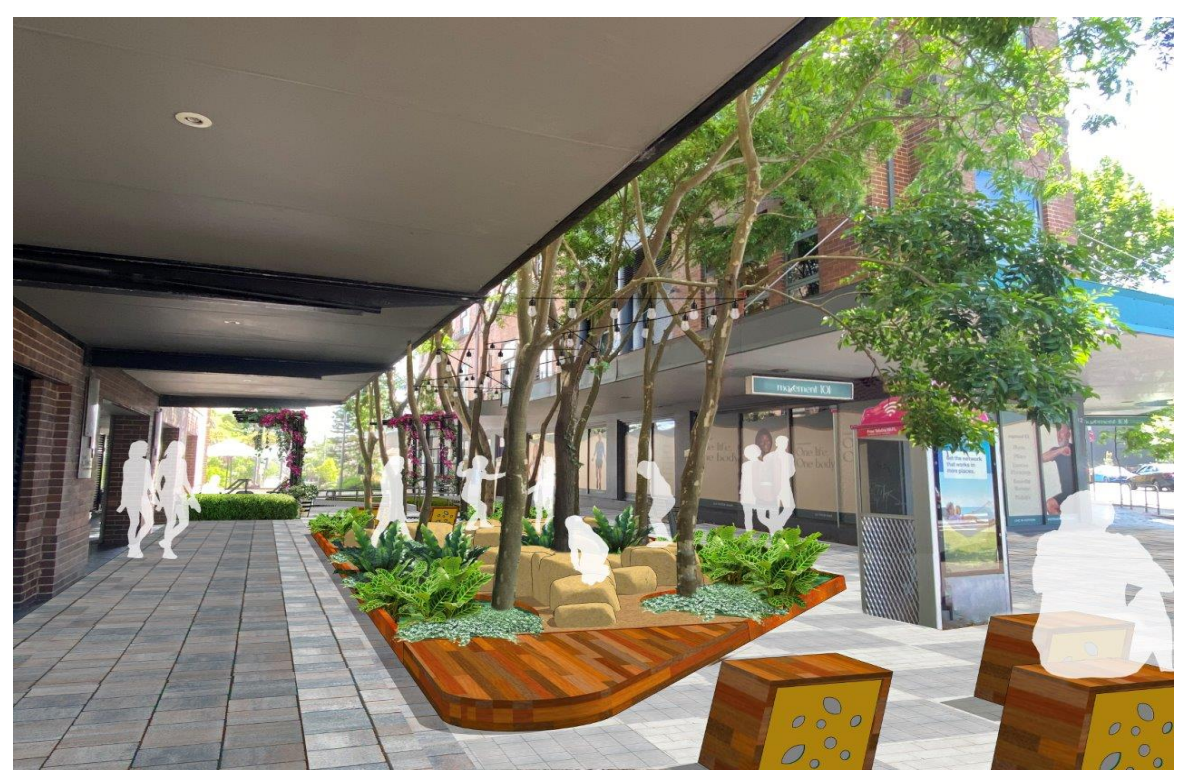
Photo 37 Both options - Precedent images for Langley Place Upgrade (Military Road)