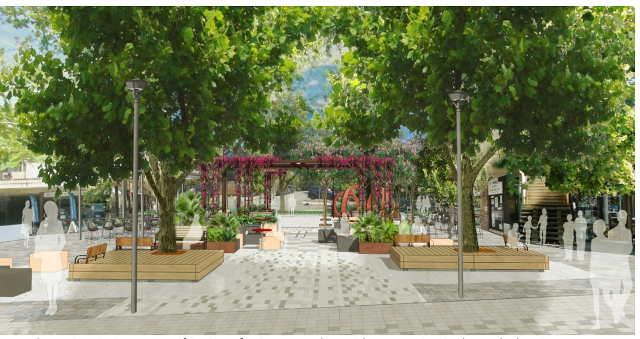
Photo 19 Artist impression of Option 1 for Cremorne Plaza with Art Deco inspired pergola day view