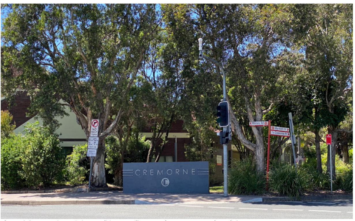
Photo 40 Gateway sign, existing condition on Military Road, corner Ben Boyd Road, Cremorne