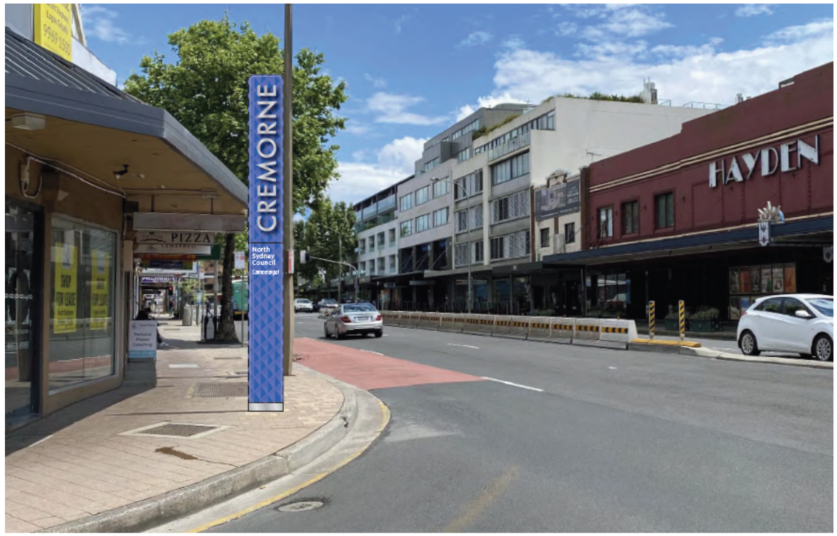
Photo 39 Artist impression of Gateway sign on Military Road, Cremorne