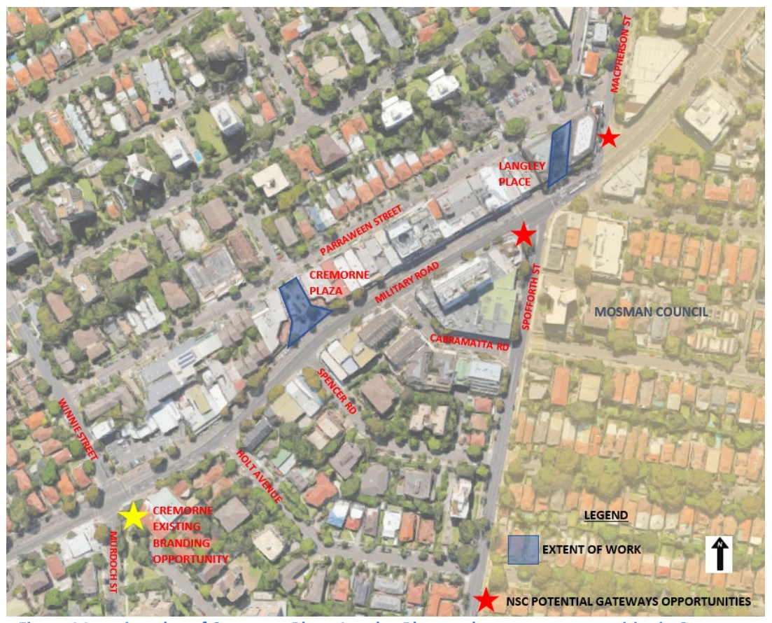
Figure 1 Location plan of Cremorne Plaza, Langley Place and gateway opportunities in Cremorne

All public domain works in the Military Road Corridor funded through the B-Line Funding Deed have now been completed. Two of the projects that were not funded under deed are the upgrading of Cremorne Plaza and Langley Place.