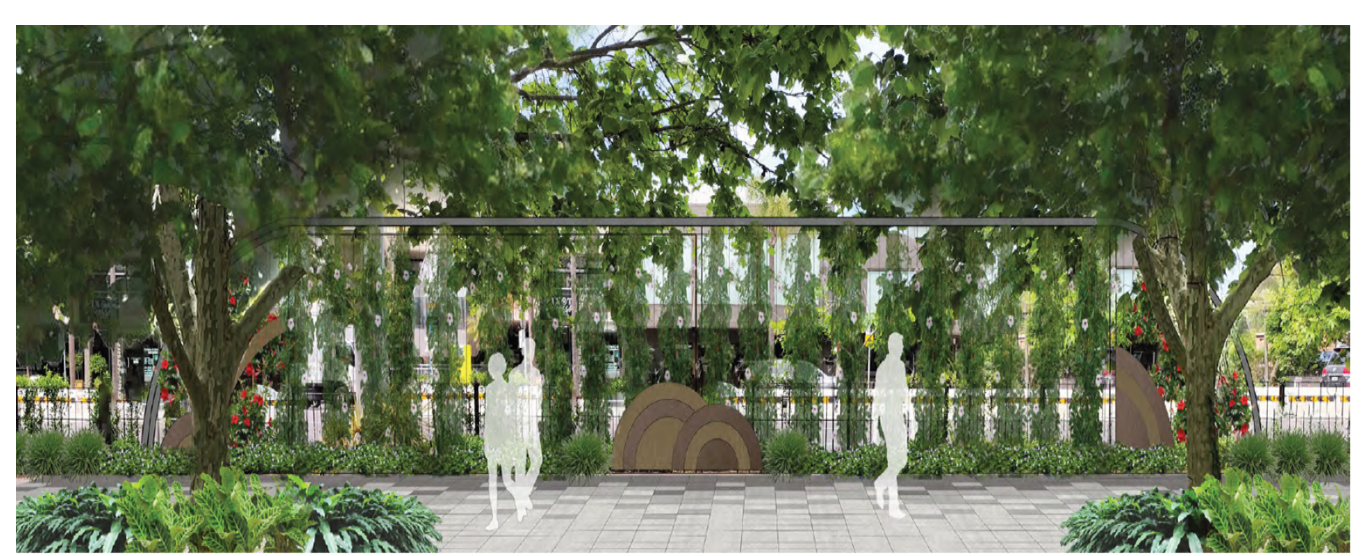
Photo 21 Trellis to screen Military Road – View from Cremorne Plaza towards Military Road