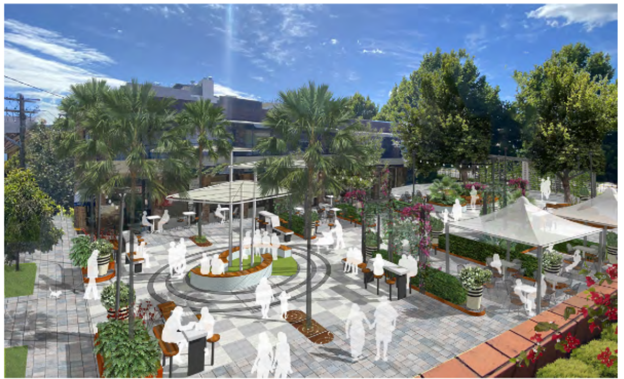
OPTION 2 VIEW