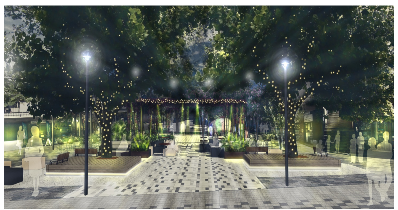
Photo 20 Artist impression of Option 1 for Cremorne Plaza with Art Deco inspired pergola night view