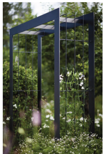
Central pergola will provide seasonal shade with the help of fragrant and colourful climbers.