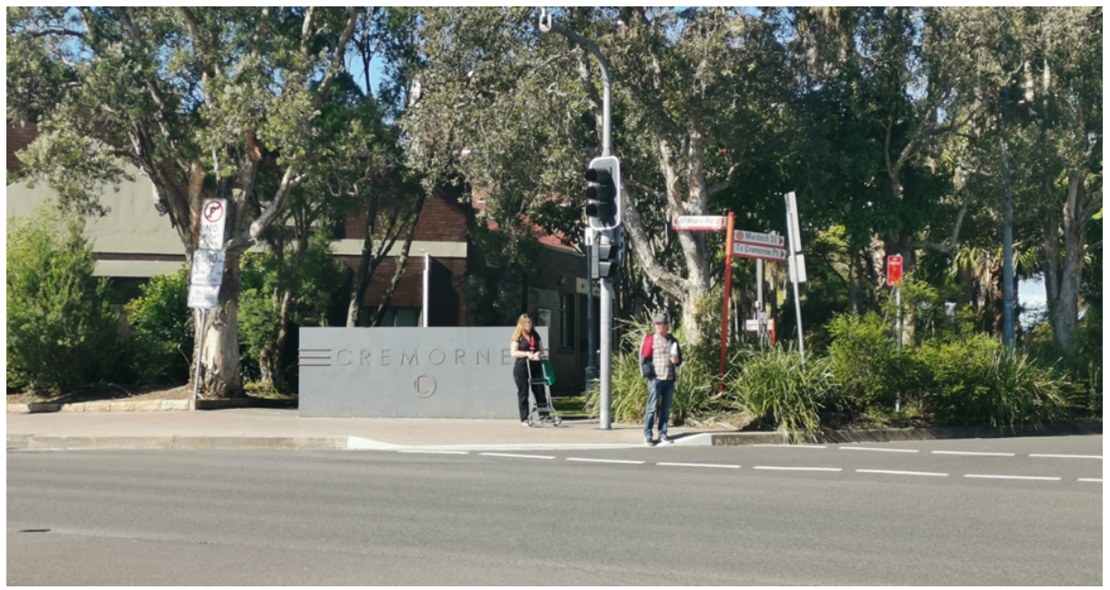
Photo 16- "Gateway Signage" at the corner of Military Road and Murdoch Street – Boundary between Cremorne and Neutral Bay on the eastern side of Military Road