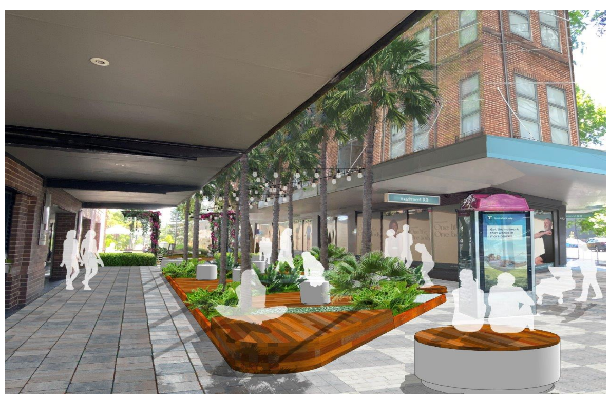
Photo 36 Artist impression of Option 1 for Langley Place Upgrade (Military Road)