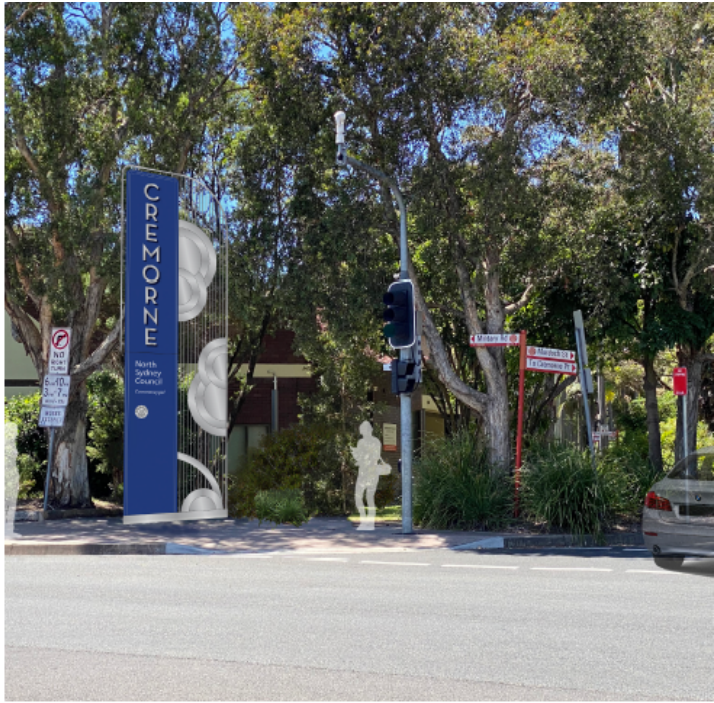
Photo 41 Artist impression of Gateway sign on Military Road, corner Ben Boyd Road, Cremorne