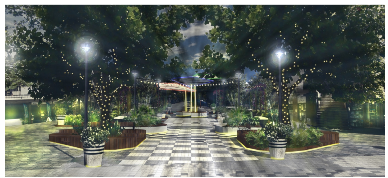
Photo 29 Artist impression of Option 2 for Cremorne Plaza with sculptural element – night view