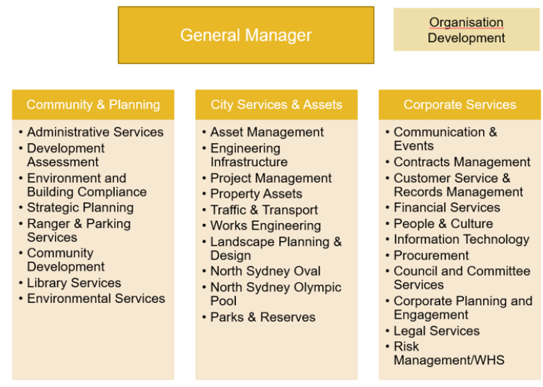
Diagram 2 – proposed structure

The functions of each senior staff member would be as per Diagram 2: