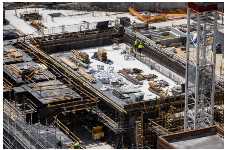
25m Pool base and walls under construction 6 February 2023