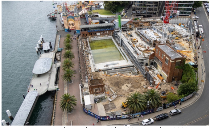
View From the Harbour Bridge 20 December 2022