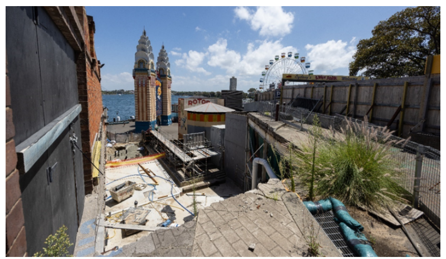
Western Stairs Slab 6 February 2023