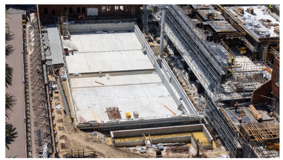
50m Pool 6 February 2023