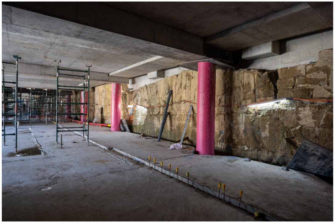
Level 1 amenities area stripped 7 March 2023