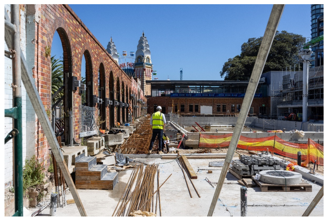
Ripples kitchen slab poured 7 March 2023