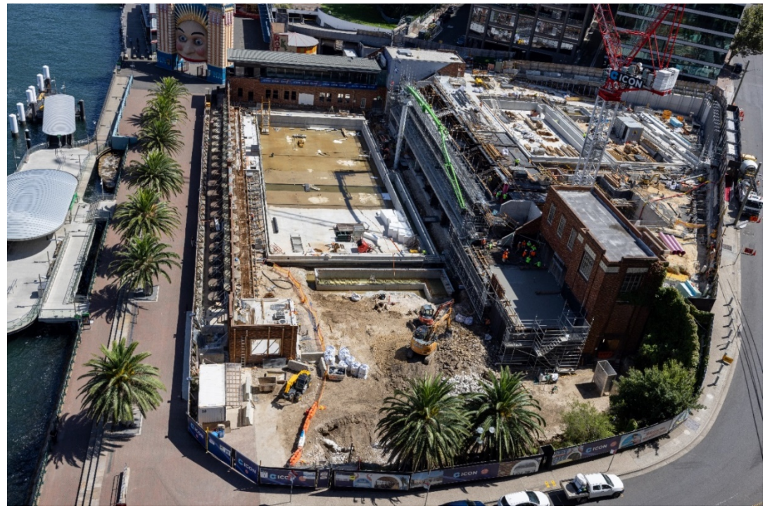
View From the Harbour Bridge 7 March 2023