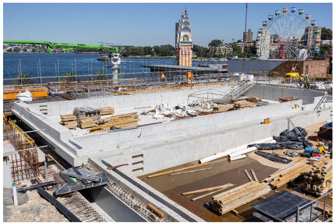
25m Pool base and walls complete 7 March 2023