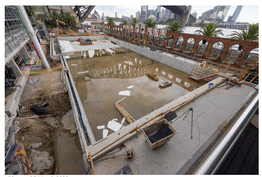
50m pool 7 March 2023