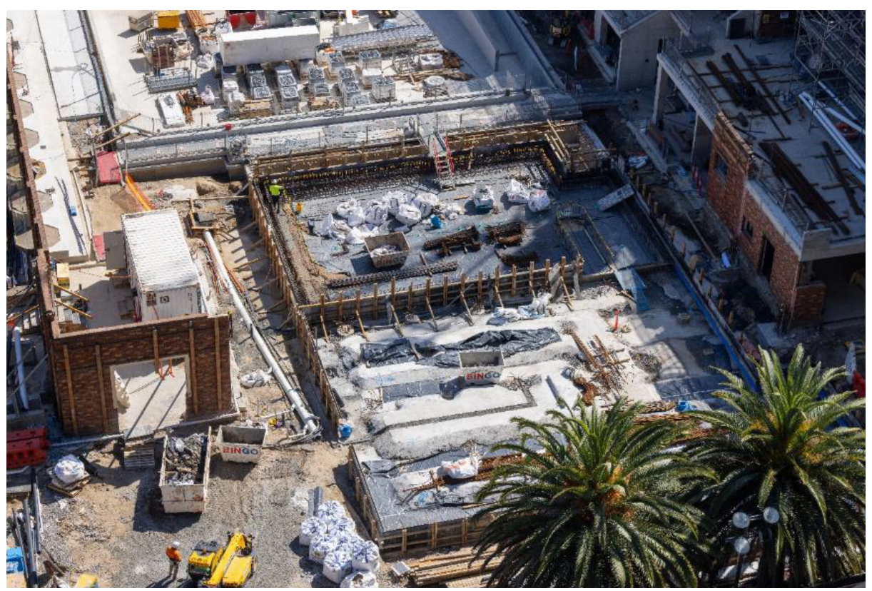
Leisure pool ready for concrete 30/8/2023