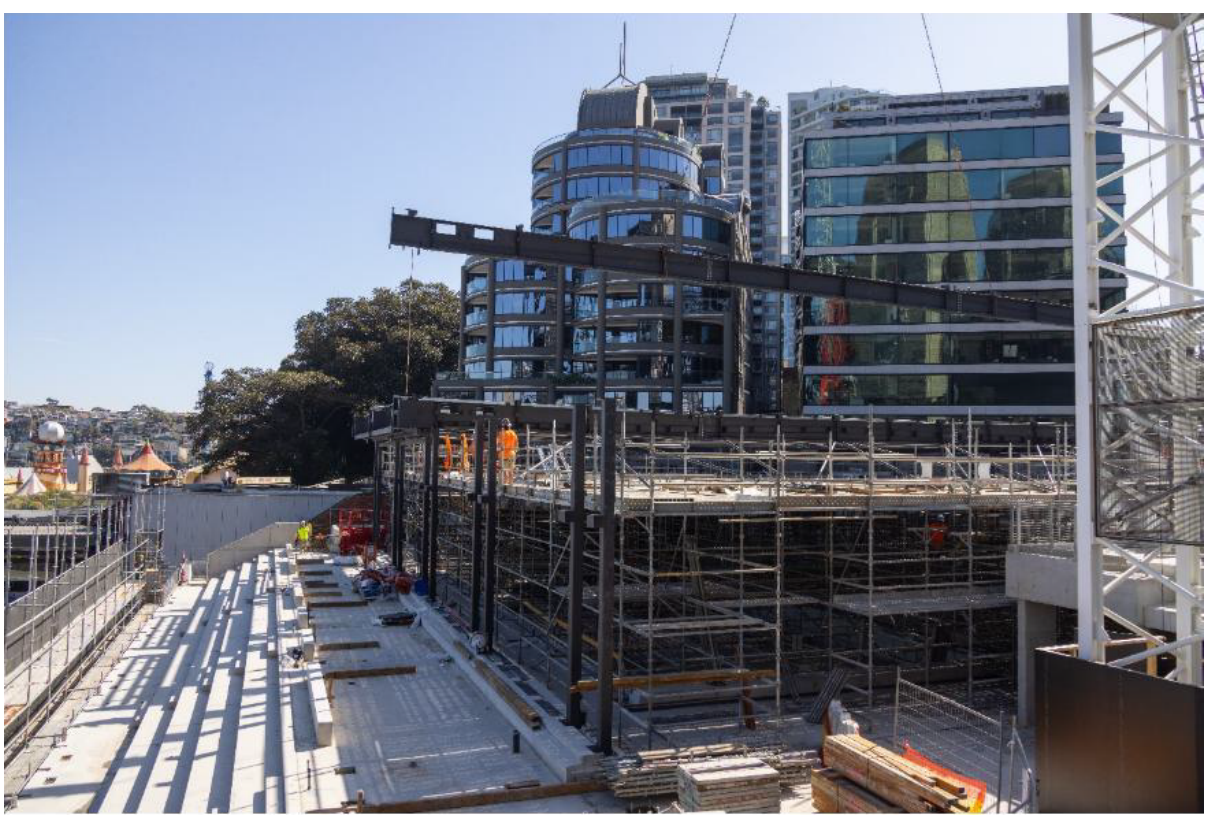
Indoor pool hall roof steel 30/8/2023