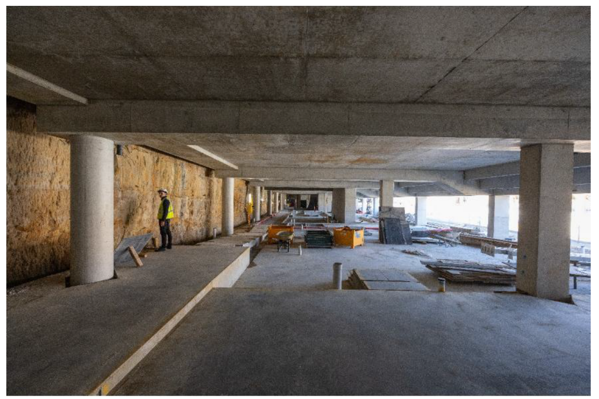
Level 1 Amenities