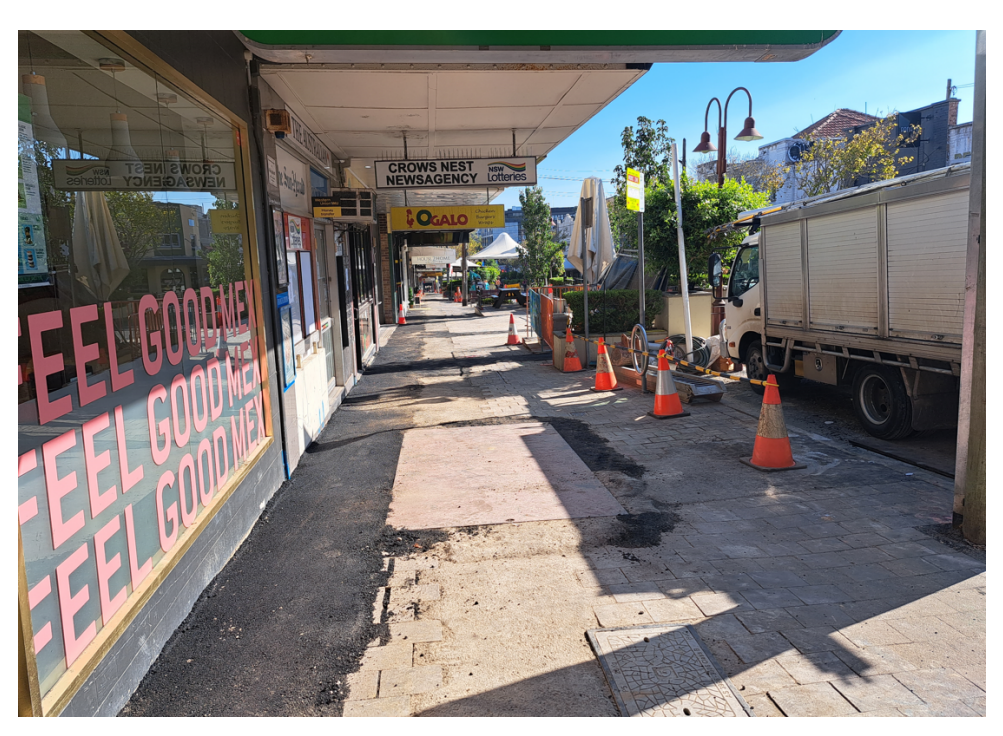
Photo 1 Willoughby Road (West side) showing uneven footpath disturbed by service trenches

The existing footpath is in poor condition and has been disturbed by electrical and drainage service trenches as part of the streetscape upgrade. The paving upgrade will reduce the risk of trips and falls by creating an even footpath surface and will return business trading conditions to normal.