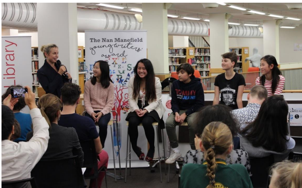
Winners participated in a panel discussion with local author and judge Ceridwen Dovey.