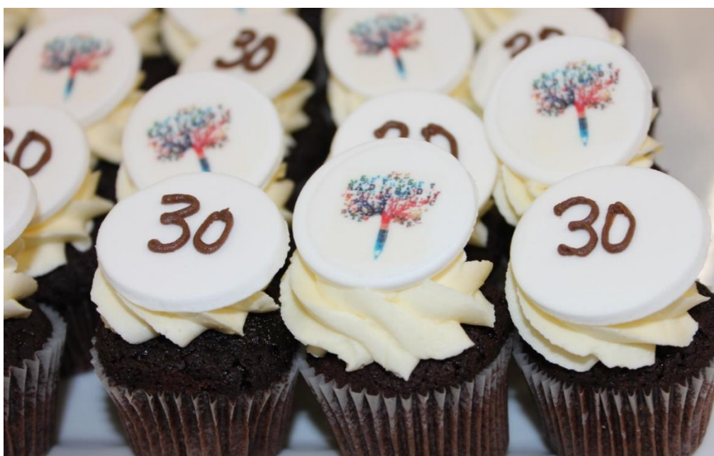
Specially decorated cupcakes were a popular feature of the reception that followed the award presentation.