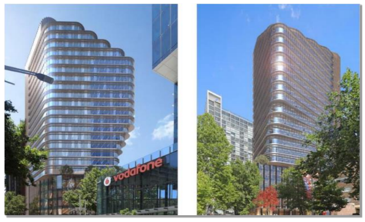
Figure 3 – Concept Design for 20 Berry Street

An indicative design, provided with the Planning Proposal is shown in Figure 3 below.